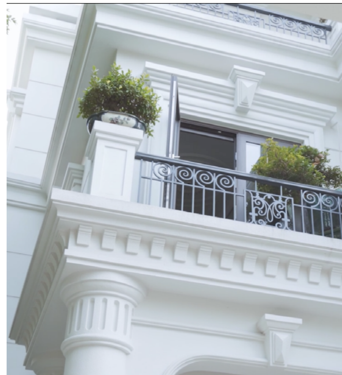
Left. Hall with our classical chandelier and wall bracket as main pieces. Right. Facade's villa, a clear and neoclassical style.