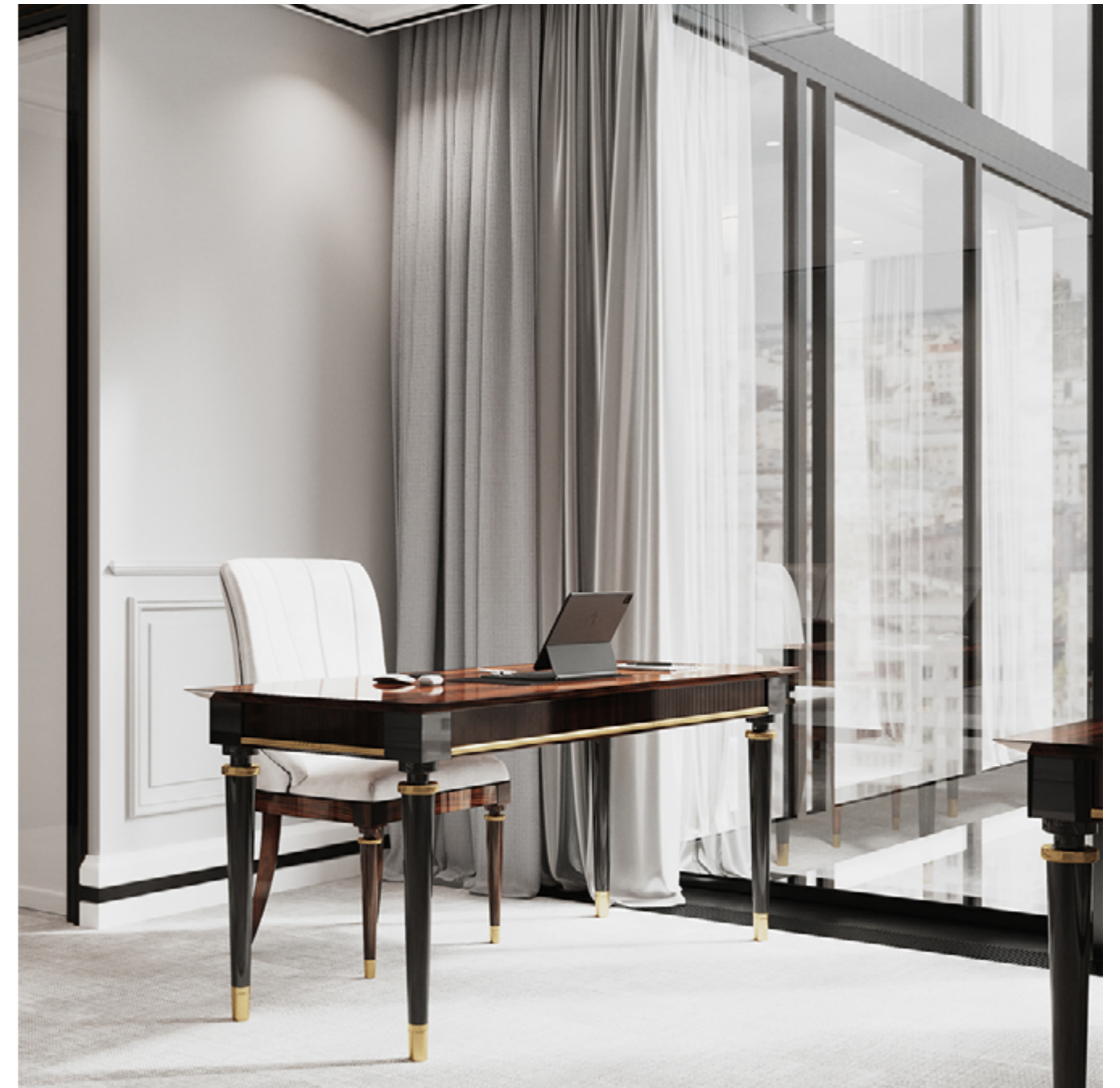
Left. Main office table and library, a bespoke pieces designed as a mix of Wellington and Nantes collections. Right. Desk from Vermont collection. Lighting from Mariner classic collections.