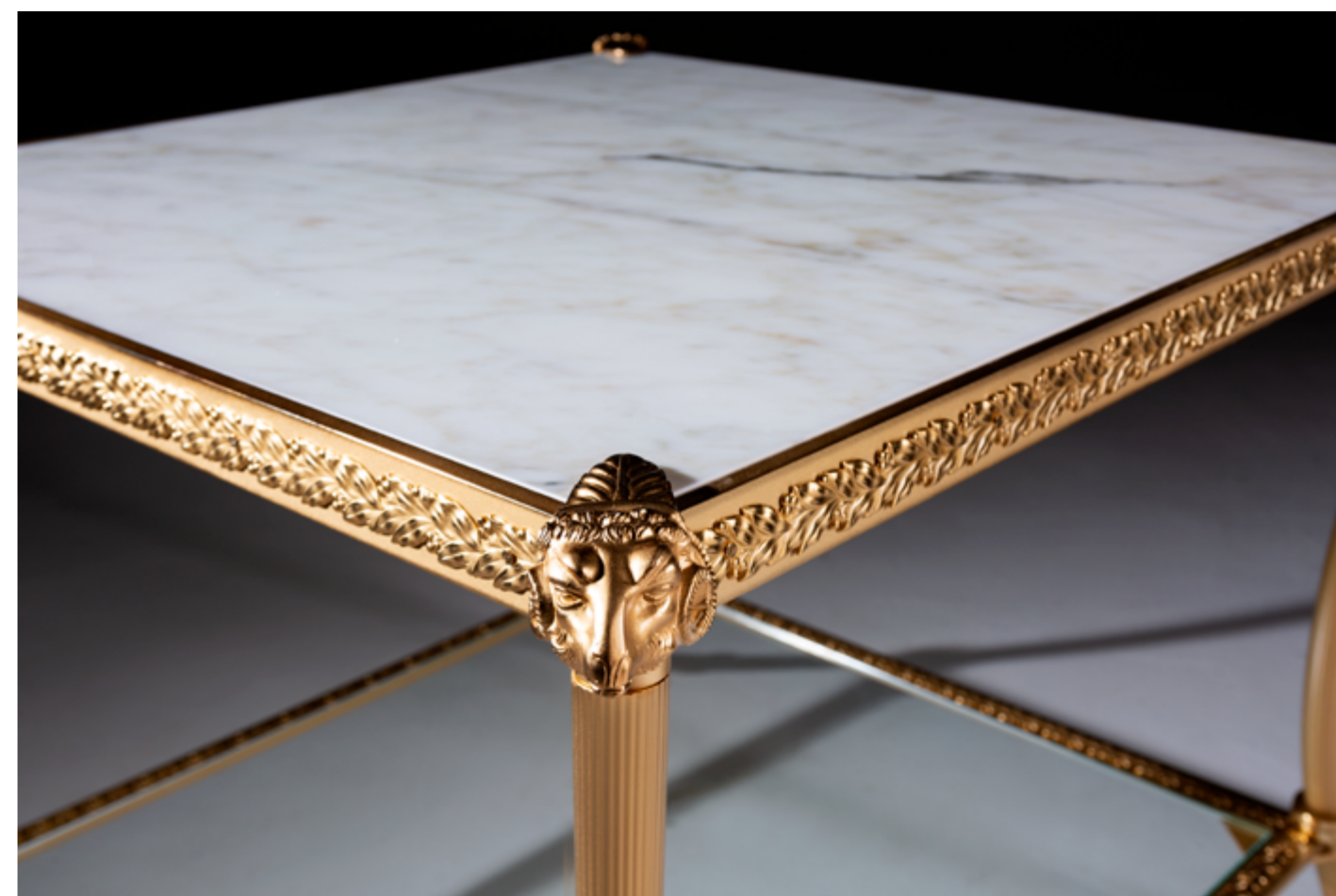
Set of side table and coffee table in casted bronze finished in Antic gold. Top in Gold Calacatta marble and shelf in clear glass.