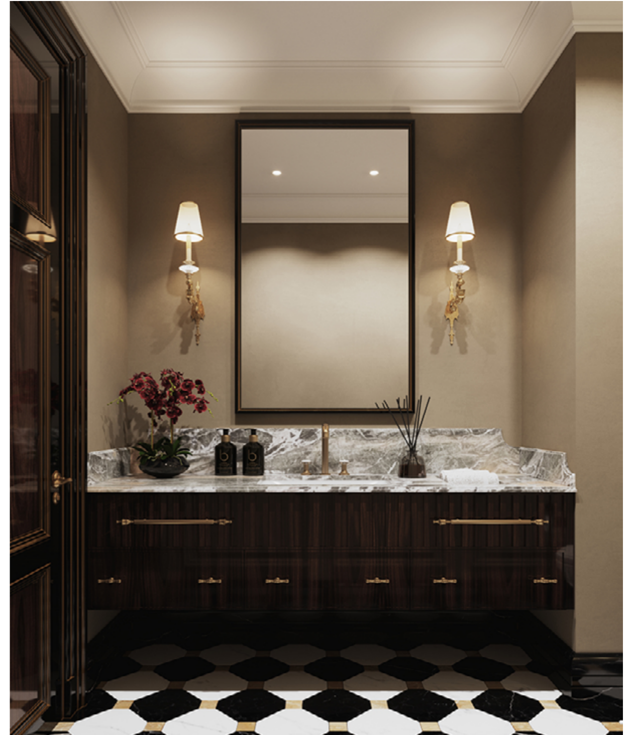
Left. Main office's hall dressed with Wellington collection and Gallery wall brackets. Right. Bathroom with bespoke furniture and classic collection wall brackets..