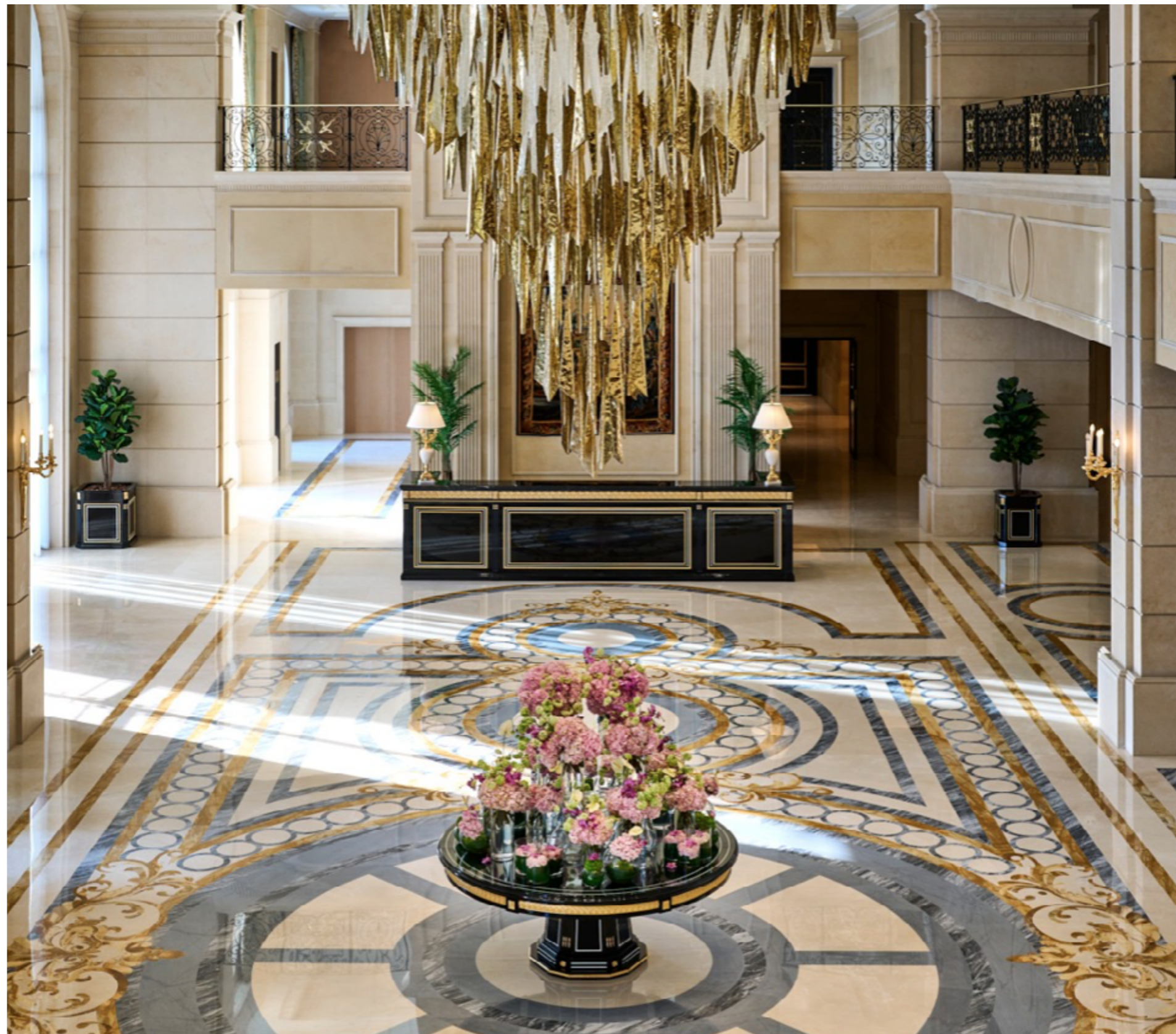
Left. Alabaster table lamp located at the front desk. Right. General view of The Plaza Doha main lobby.