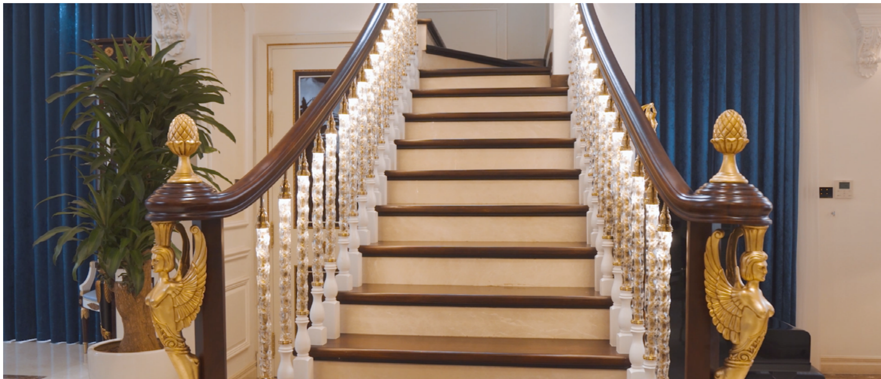
Exclusive stairs. A custom design, with two winged sculptures as the start of the handrail, based on our collection of sofas located at the living room.