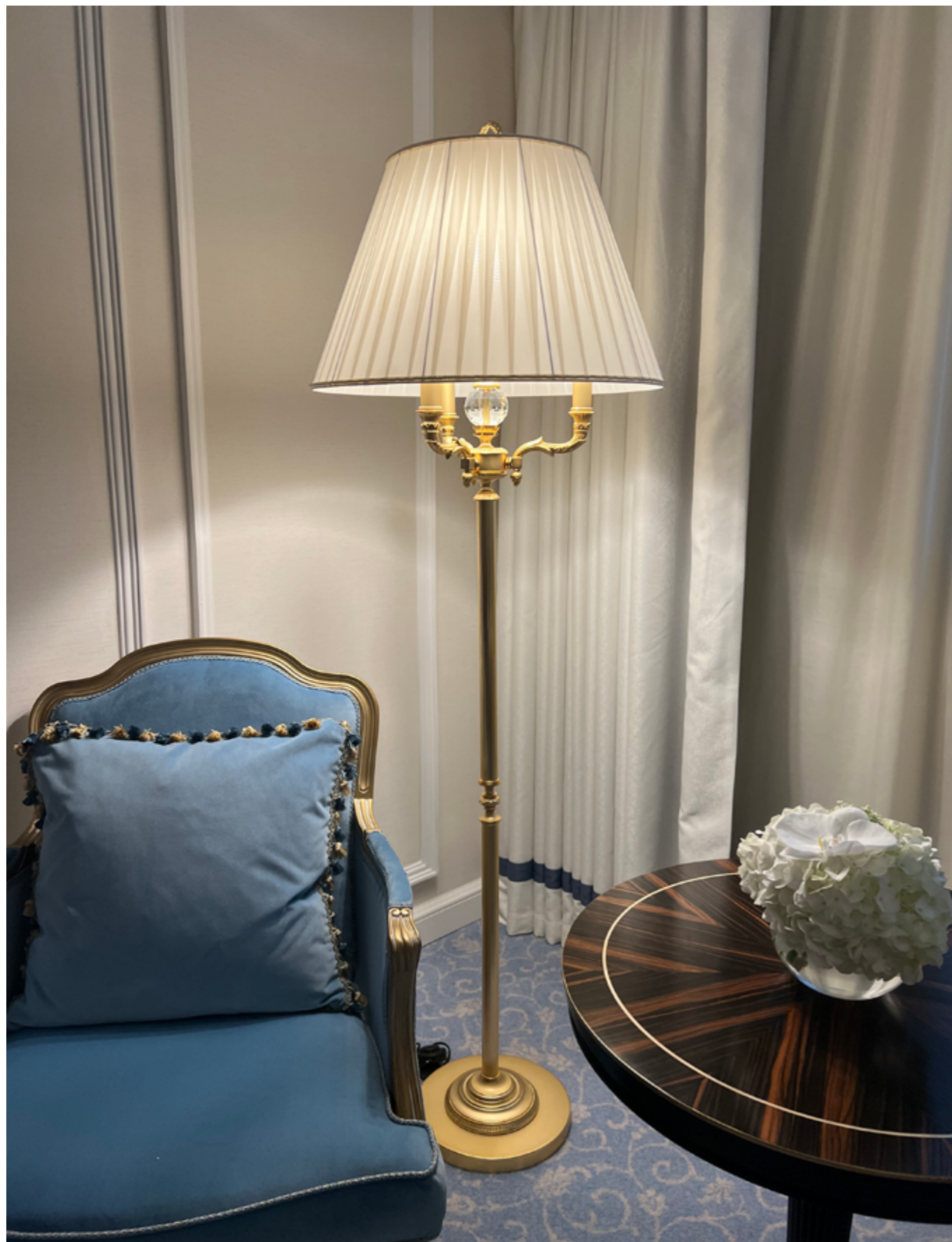
Antique gold floor lamps, located next to the side tables at the hotel's suite bedrooms.