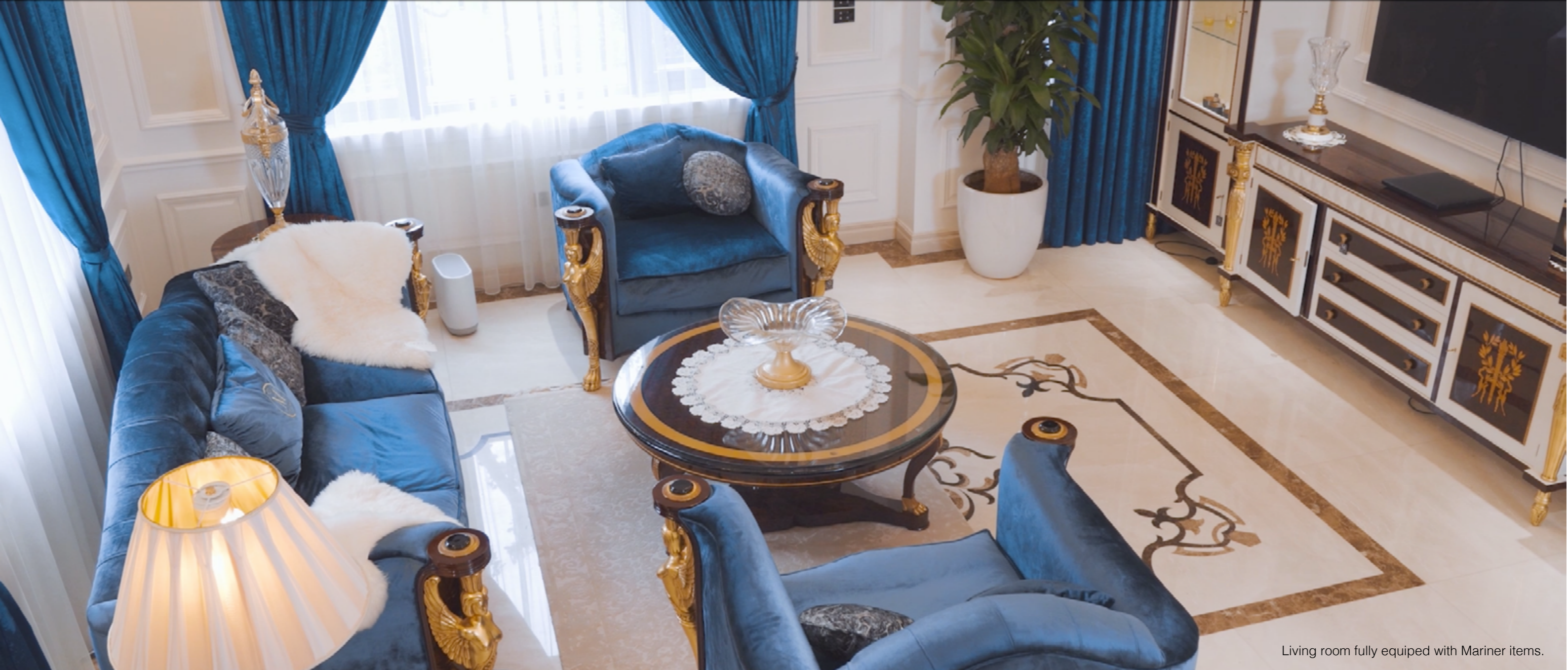
Living room fully equipped with Mariner items.