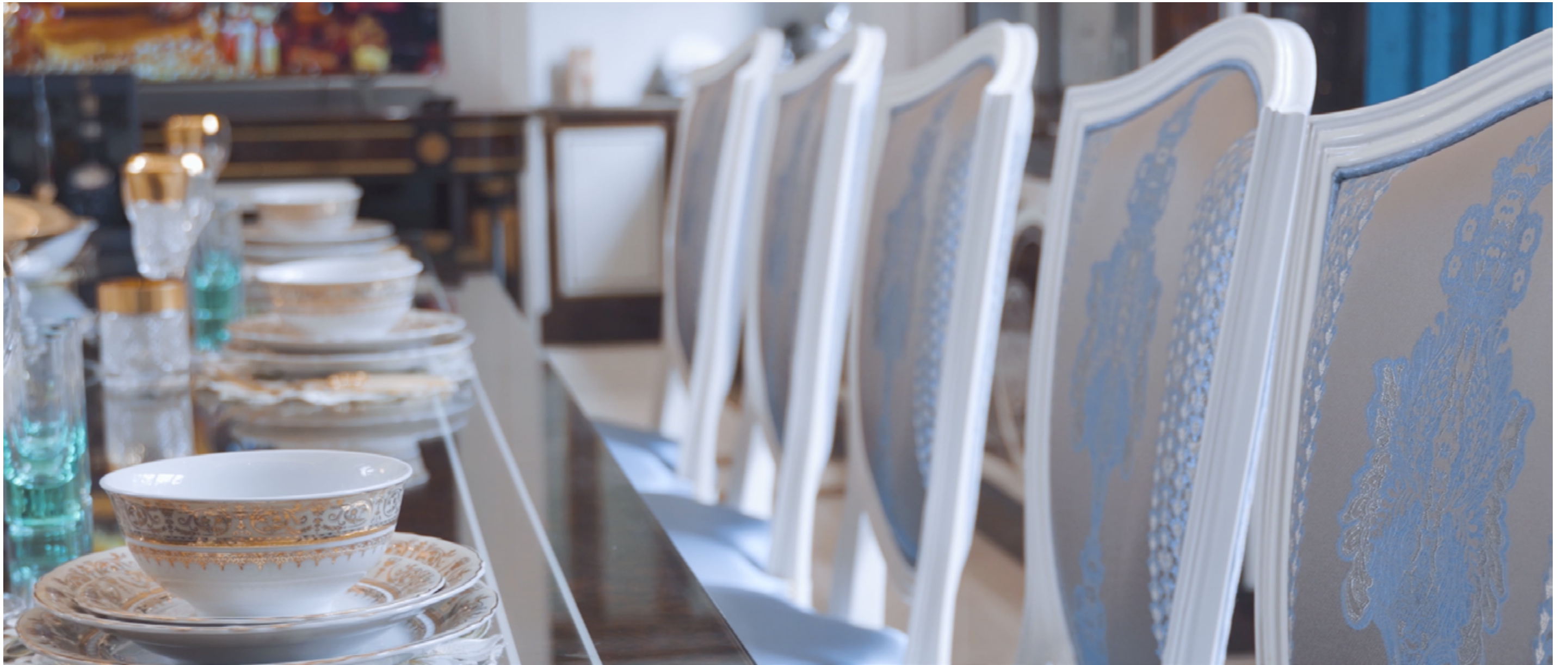
Detail of the Malmaison dining room.