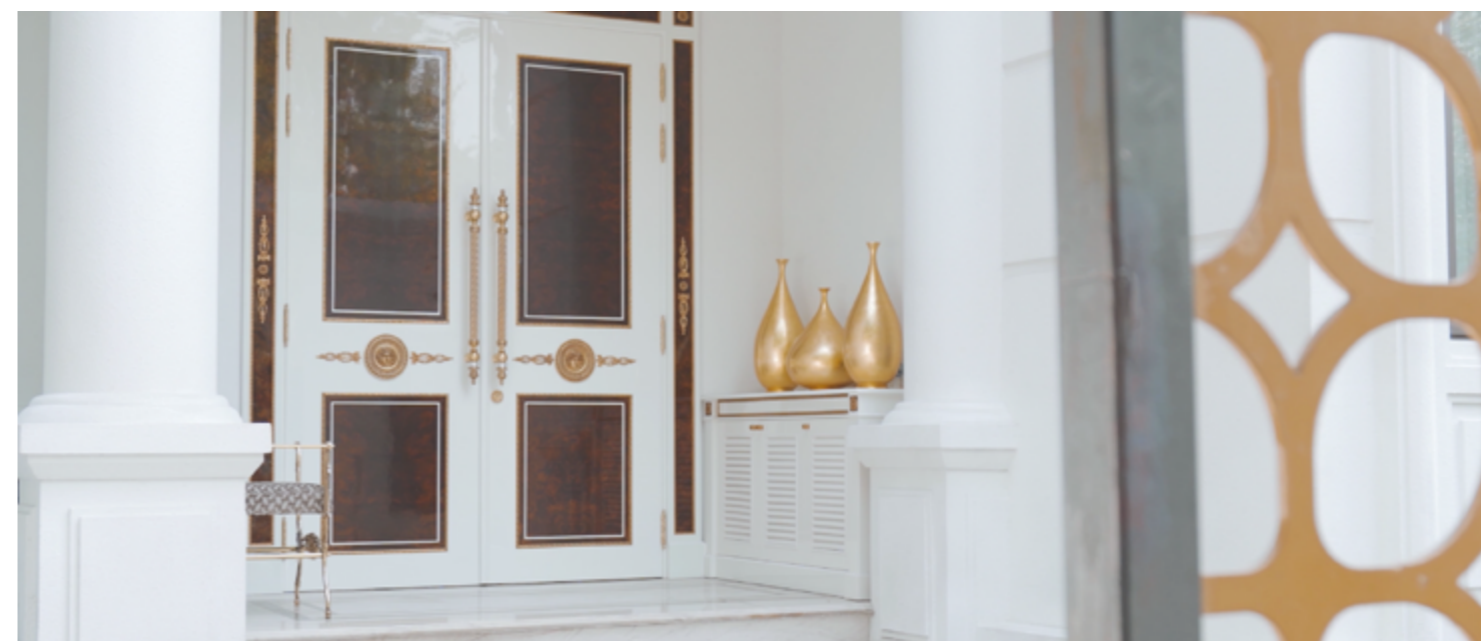
Main entrance with bespoke double door.

Also, as front door, it has been designed a main entrance with walnut bulb and high gloss white laquer, fitting perfectly with the whole look.