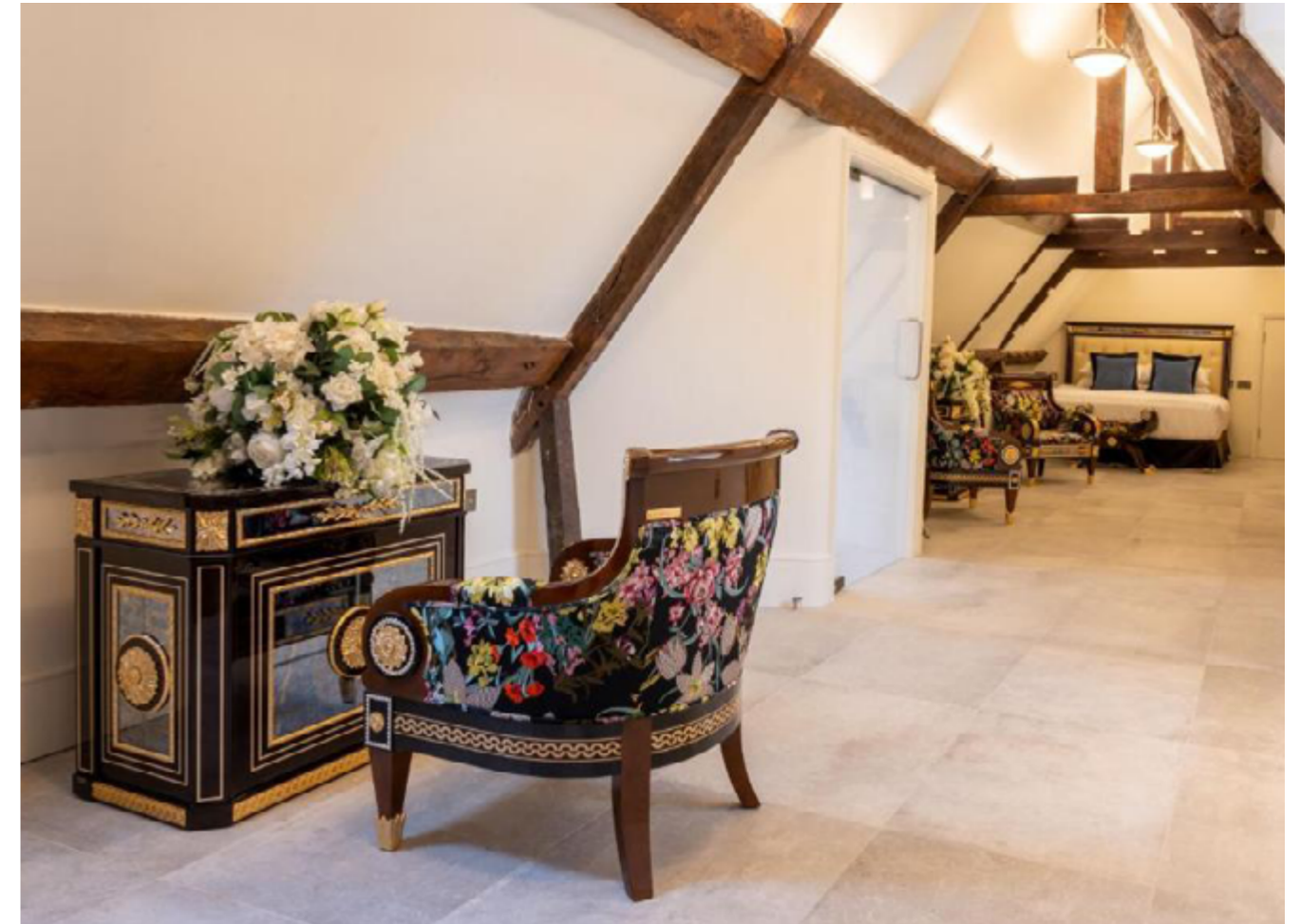
Richmond collection suite bedroom and entrance to the hotel.