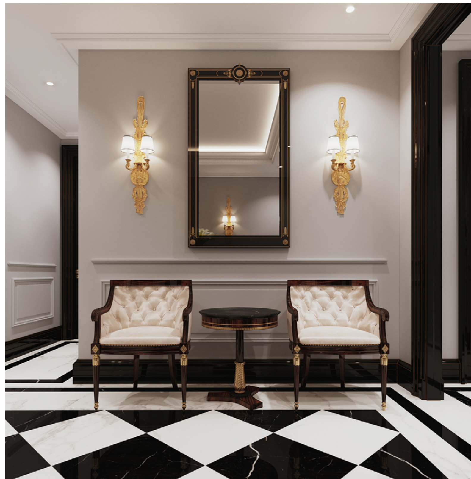
Reception equipped with Bordeaux pieces, Rivoli mirror and classical wall brackets.