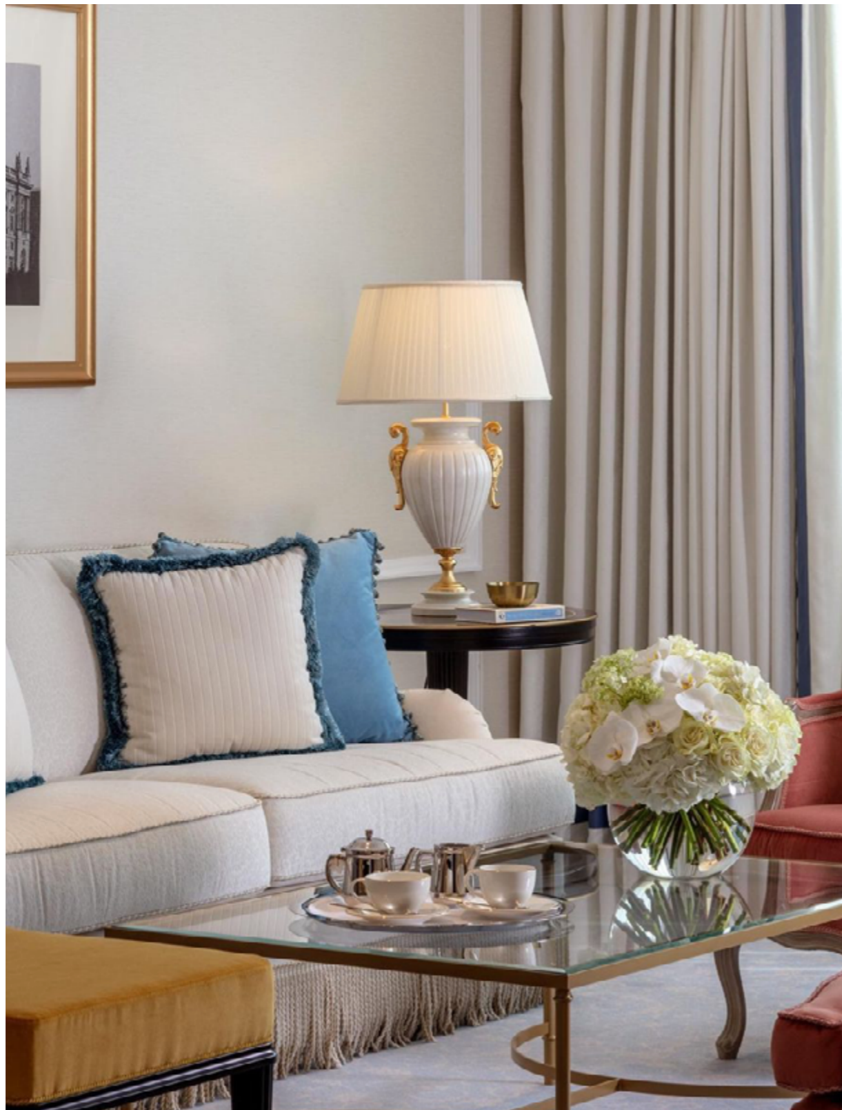
Table lamps, so elegants, giving a touch of light to the living room suite's,