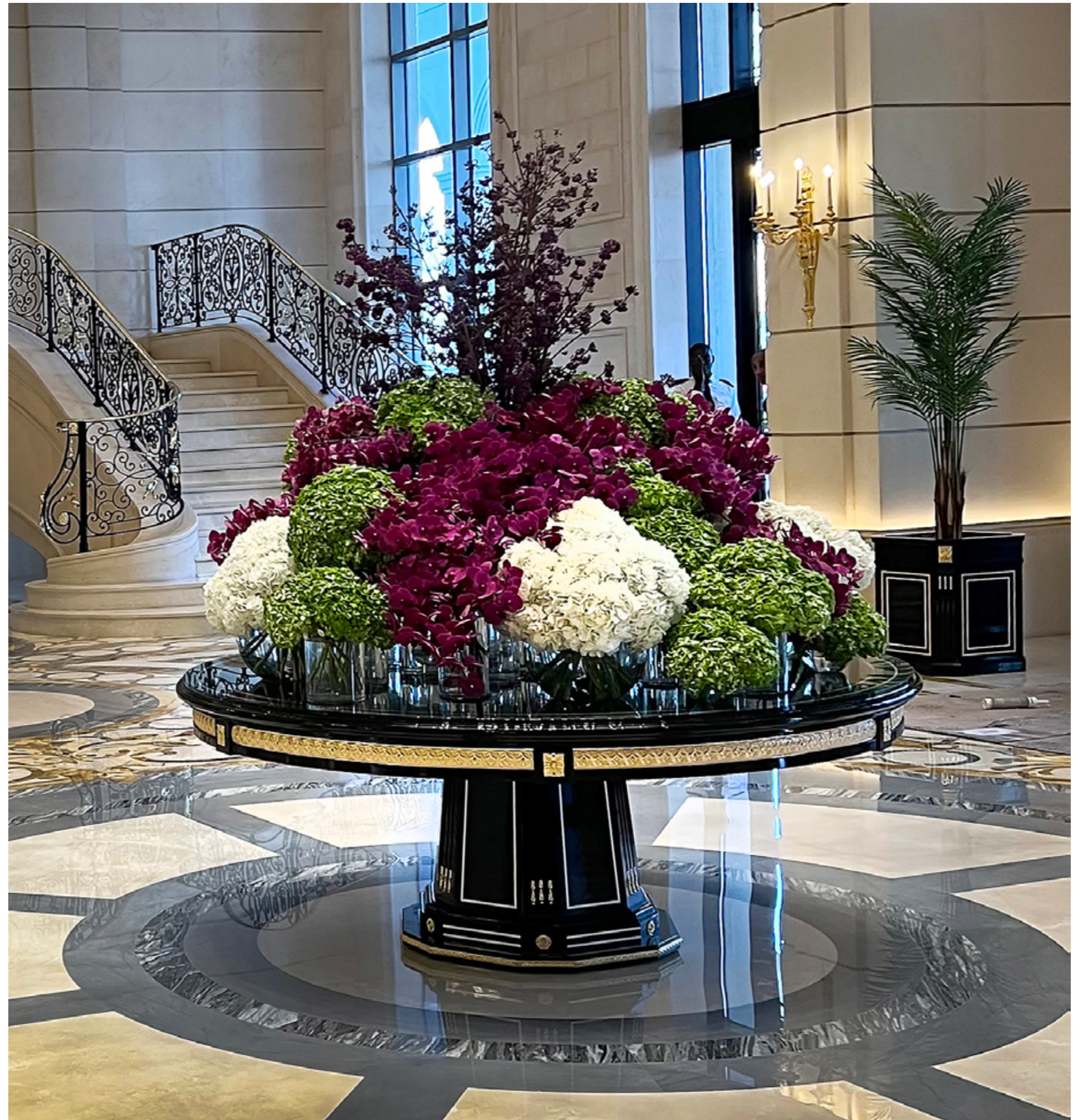
Special hall table and planters for the main lobby of The Plaza Doha.

The Plaza Doha Hotel , owned by Al Samrya Group, entrusted Mariner for the furniture and lighting of the main common areas, as well as some of its most important suites. Main lobby, restaurant, suites, even bathrooms, have been decorated with some of our gold leaf mirrors, alabaster table lamps, brass and marble coffee tables, planters and special hall tables, floor lamps in every suite. Even the main piece, the imposing reception counter, designed and manufactured by Mariner, was one of the key pieces that marked the style of the entire hotel. Elegance and sophistication radiates from this hotel in every detail, in every finish.