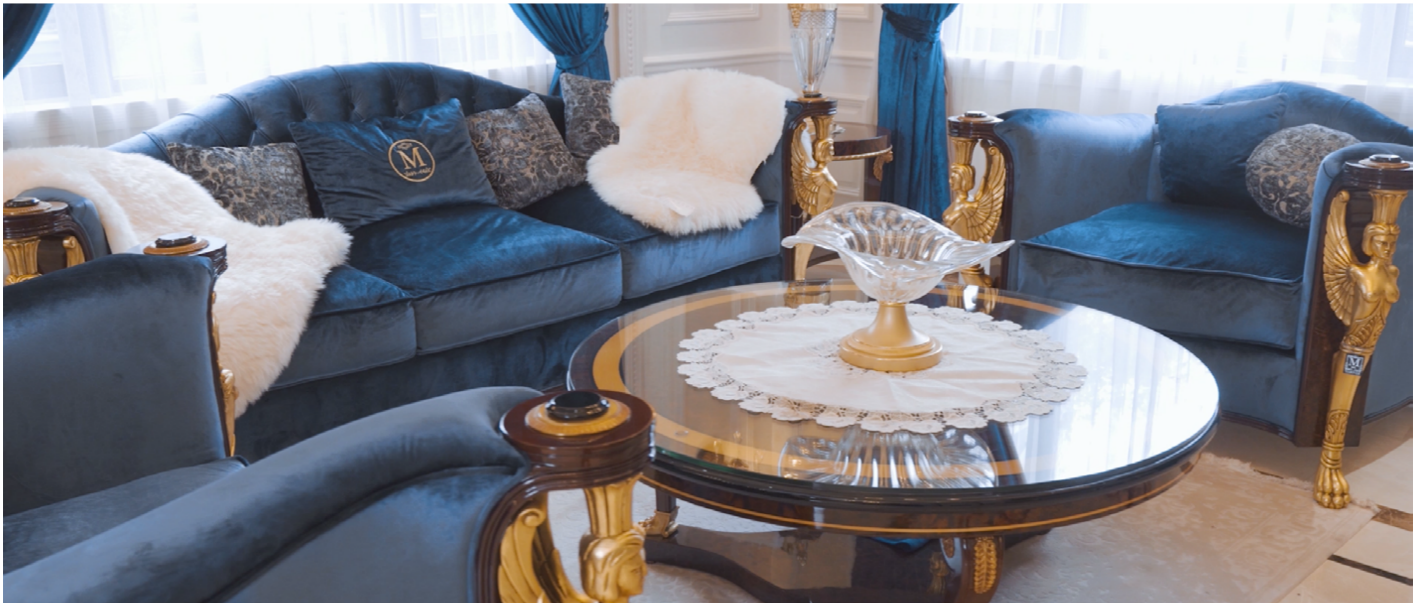
Set of sofas and coffee table, composed with Singular pieces, from our classic collection. Upholstered in blue velvet and decorated with 24k gold leaf and Ash tree bulb.