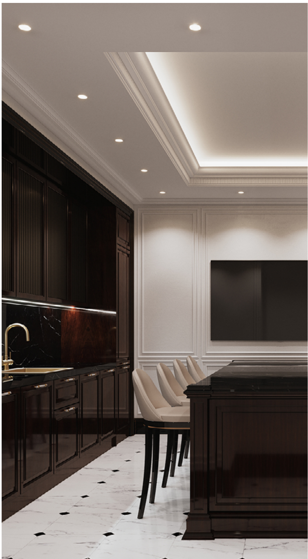
Bespoke kitchen fully equipped. Stools from Mariner's Occasional pieces in leather.