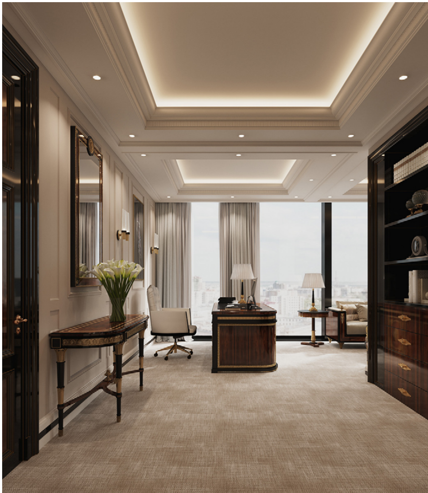
Left. Mirror and console from Wellington collection. Right. Office entrance, designed with bespoke joinery.