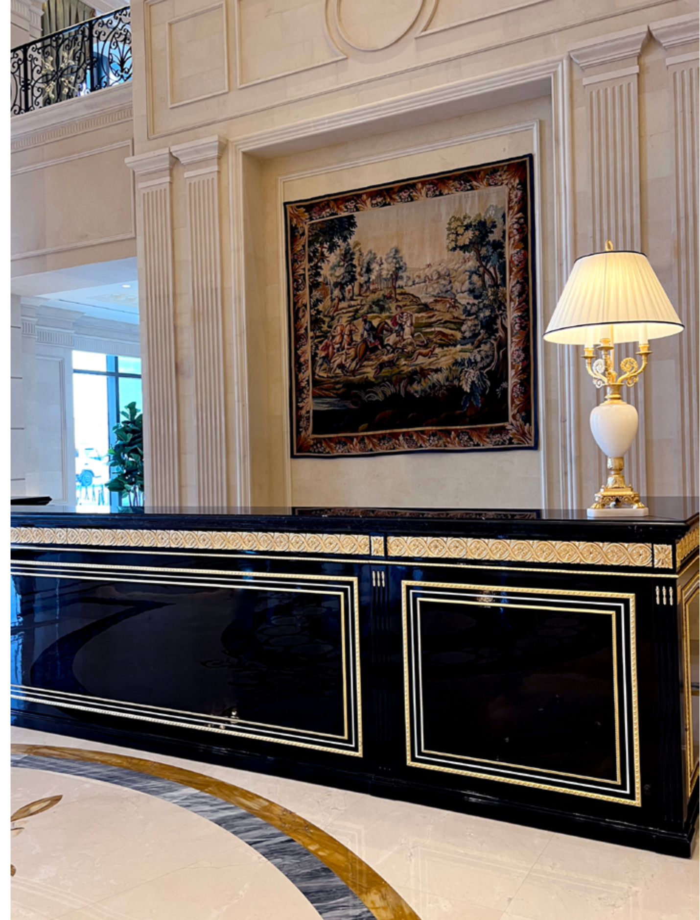
Left. Back view of the main bespoke lobby counter. Right. Front view of the main lobby counter. A bespoke design for the magnificent entrance of The Plaza Doha. On the top, two alabaster table lamps are the only decoration needed. A perfect match.