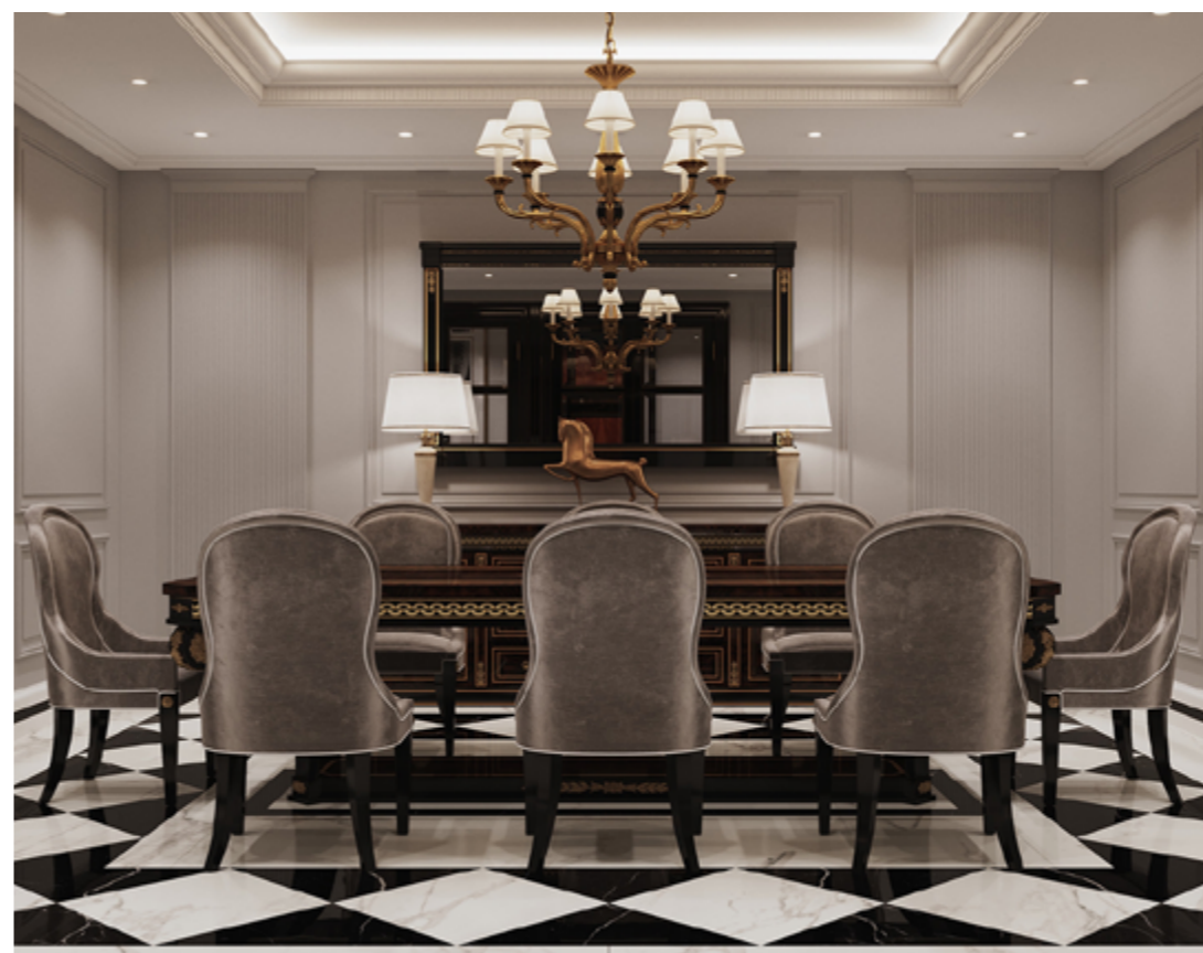
Up. Meetings room fully equipped with Neva collection. Down. Mirror and Sideboard from Neva collection. Alabaster table lamps from classic collection.