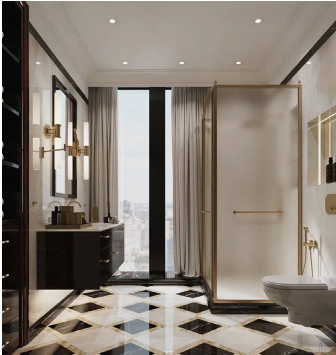
Private bathroom. Bespoke furniture with makassar veneer, Creta mirror and Gallery wall brackets.