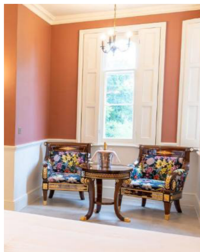
Suite bedroom of Weston Manor Hotel with Richmond and Trianon Collections.