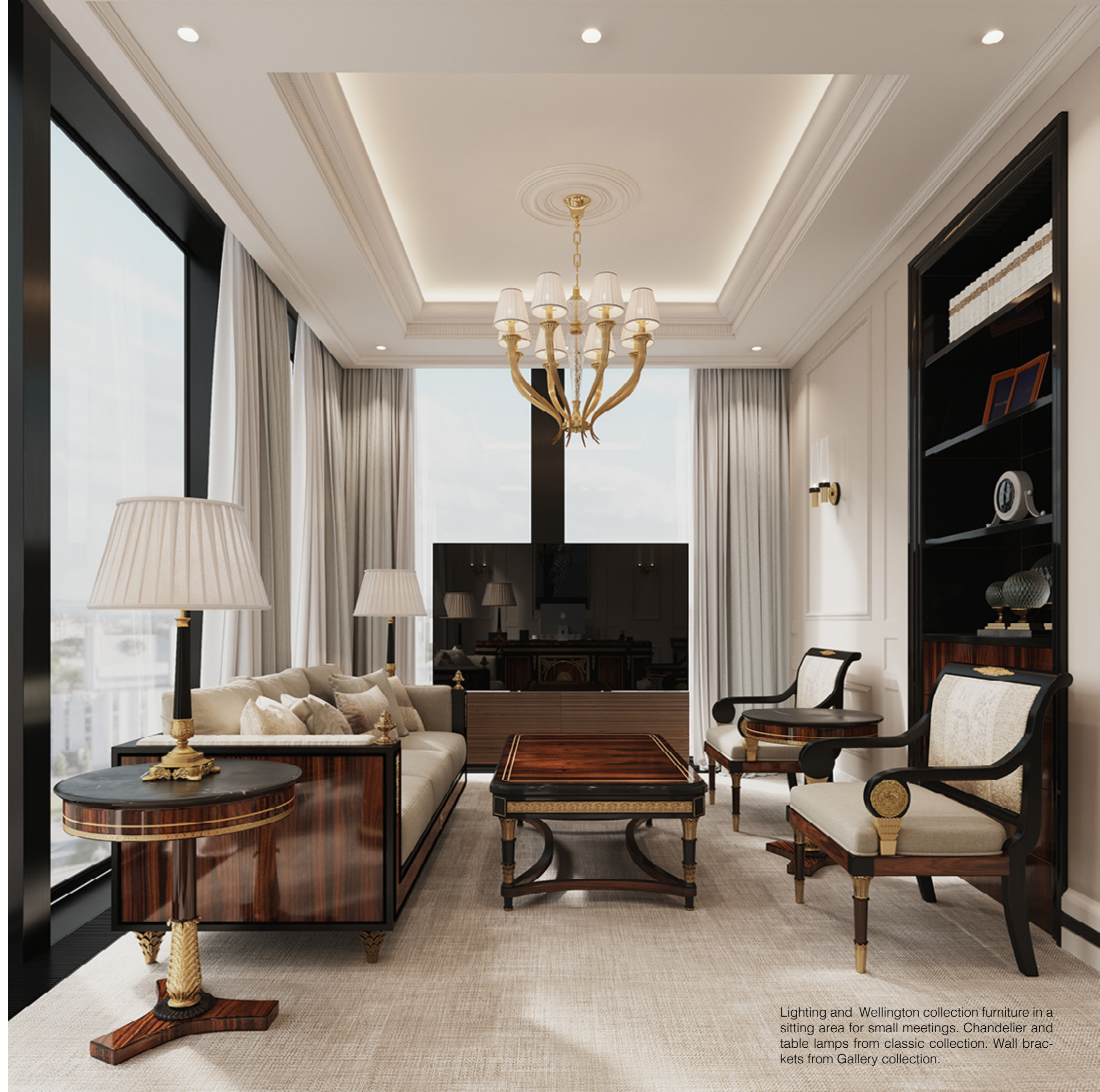
Lighting and Wellington collection furniture in a sitting area for small meetings. Chandelier and table lamps from classic collection. Wall brackets from Gallery collection.

Noble materials such as Brazilian Rosewood veneer, casted bronze and 24k golden leave, dress their areas transporting us to a quiet place.