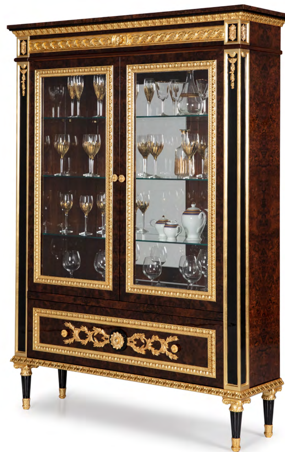
CABINET– Ref.: 50598.0 Height: 215 cm / 84,65 in Width: 154 cm / 60,63 in Depth: 45 cm / 17,72 in Net weight: 213,00Kg / 83,86 lb Finish: NON.POE / OA (584/231)