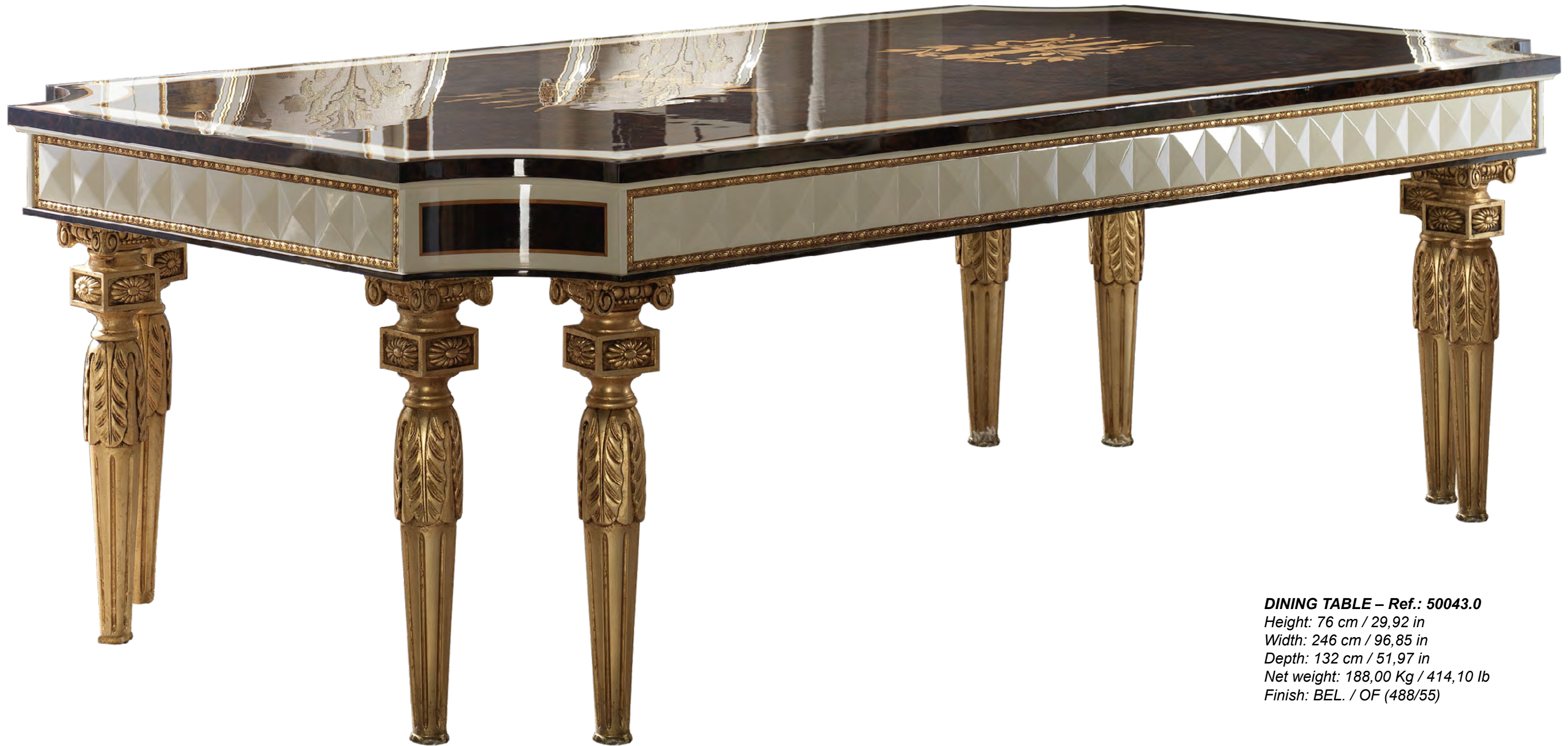
DINING TABLE – Ref.: 50043.0 Height: 76 cm / 29,92 in Width: 246 cm / 96,85 in Depth: 132 cm / 51,97 in Net weight: 188,00 Kg / 414,10 lb Finish: BEL. / OF (488/55)