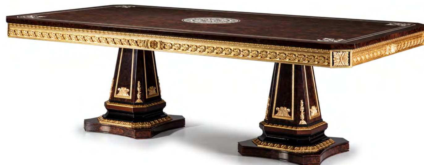
DINING TABLE – Ref.: 50595.0 Height: 77 cm / 30,32 in Width: 250 cm / 98,43 in Depth: 135 cm / 53,15 in Finish: Finish: NON.POE / OA (584/231)