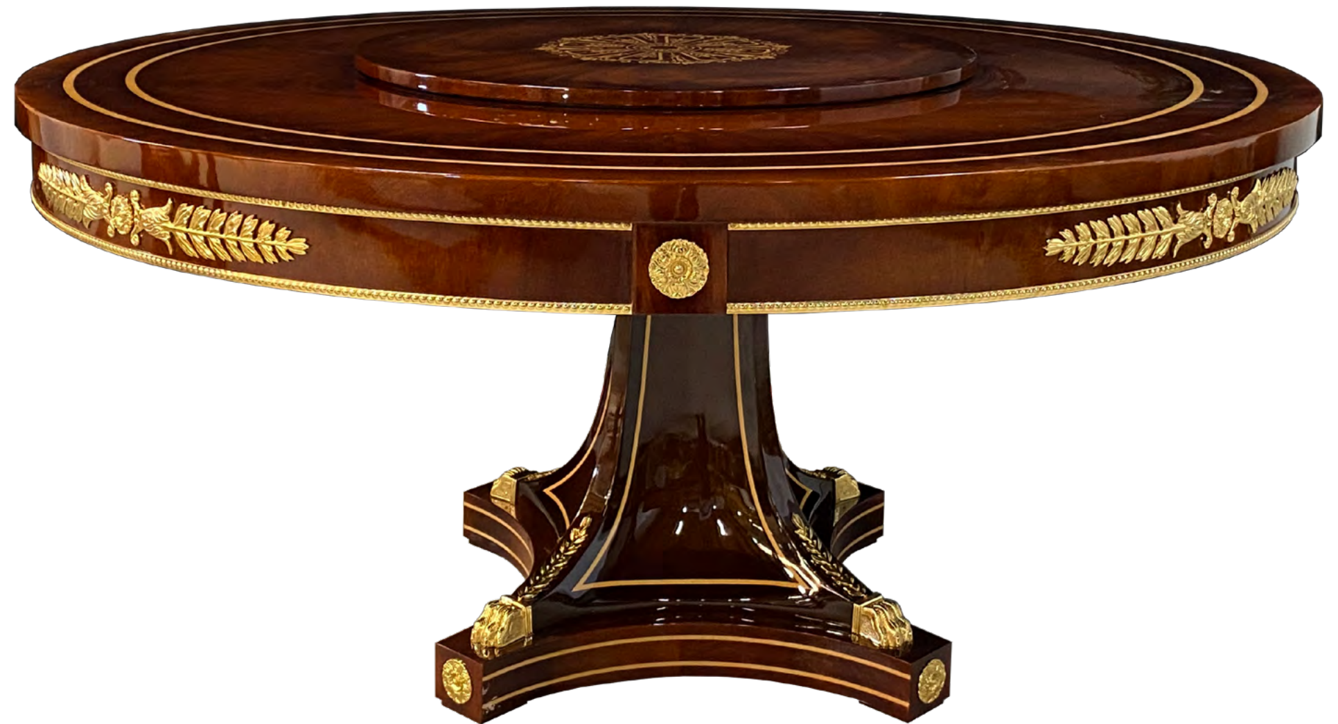
BESPOKE DINING TABLE – Ref.: 92764 Height: 81 cm / 31,89 in Width: Ø160 cm / 62,99 in Net weight: 110,00 Kg /242,29 lb Finish: CAMD.B /OA (523/231)