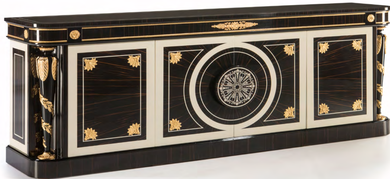
SIDEBOARD – Ref.: 50432.0