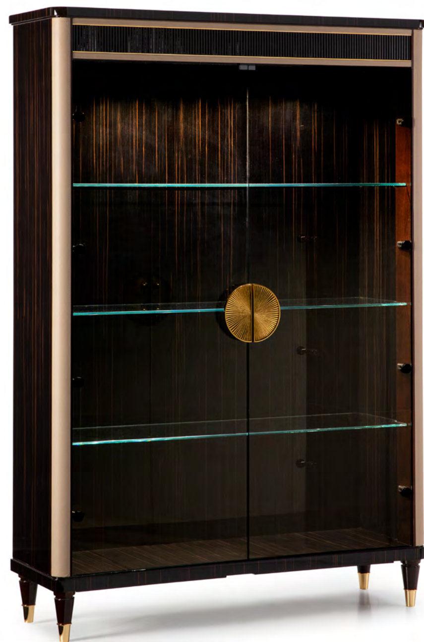
CABINET – Ref.: 50570.0 Height: 190 cm / 74,8 in Width: 130 cm / 51,18 in Depth: 40 cm / 15,75 in Net weight: 185,00 Kg / 407,49 lb Finish: MAK.B/NB /DB/OA (598/595) Leather: 250.005