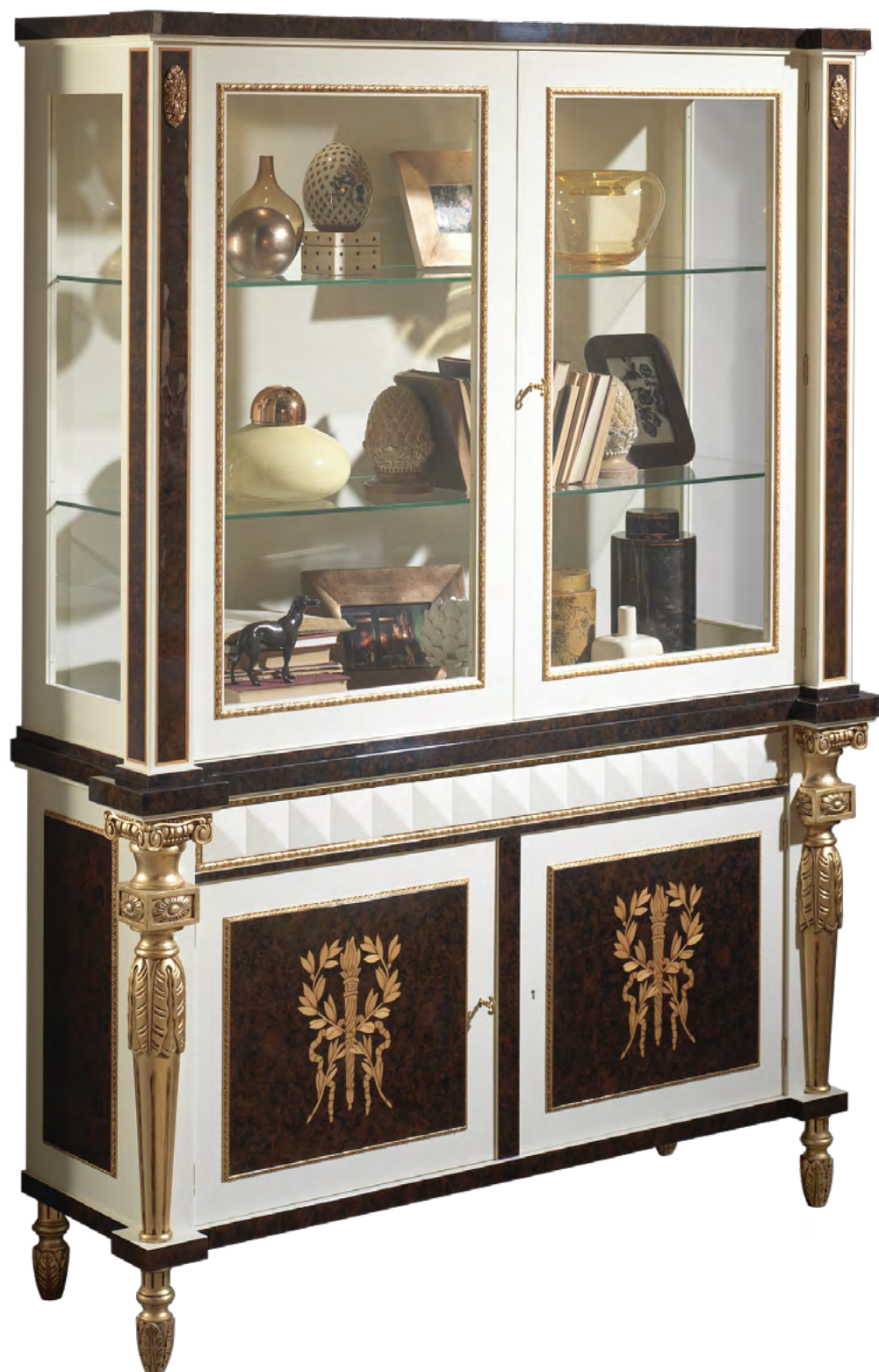
CABINET – Ref.: 50033.0 Height: 210 cm / 82,68 in Width: 154 cm / 60,63 in Depth: 51 cm / 20,08 in Net weight: 224,00 Kg / 493,39 lb Finish: BEL. / OF (488/55)