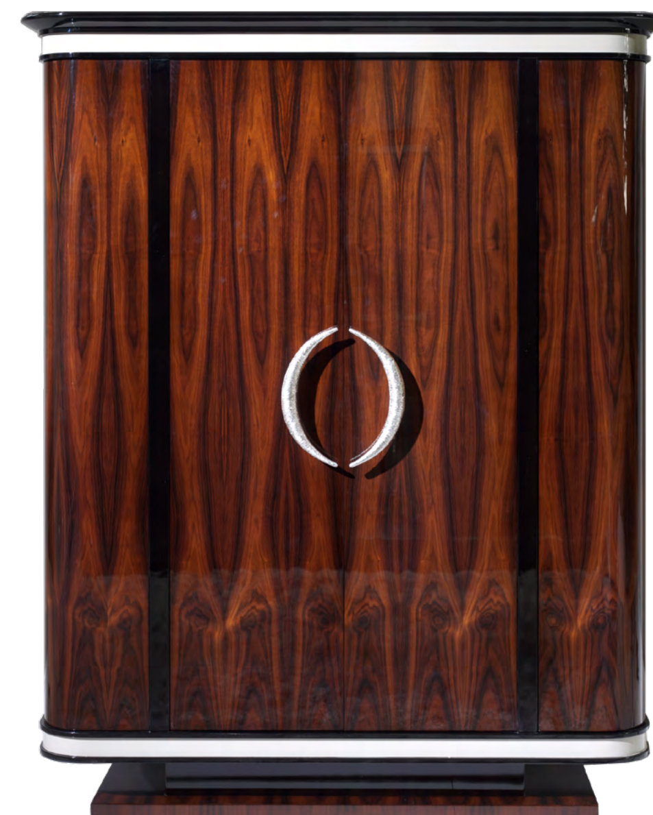
CABINET – Ref. 50196.0 Height: 166 cm / 65,35 in Width: 135 cm / 53,15 in Depth: 47 cm / 18,5 in Net weight: 165,00 Kg / 363,44 lb Finish: CA.B / PLA.B (490/4)