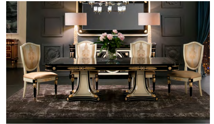
5. MALMAISON (page 94)