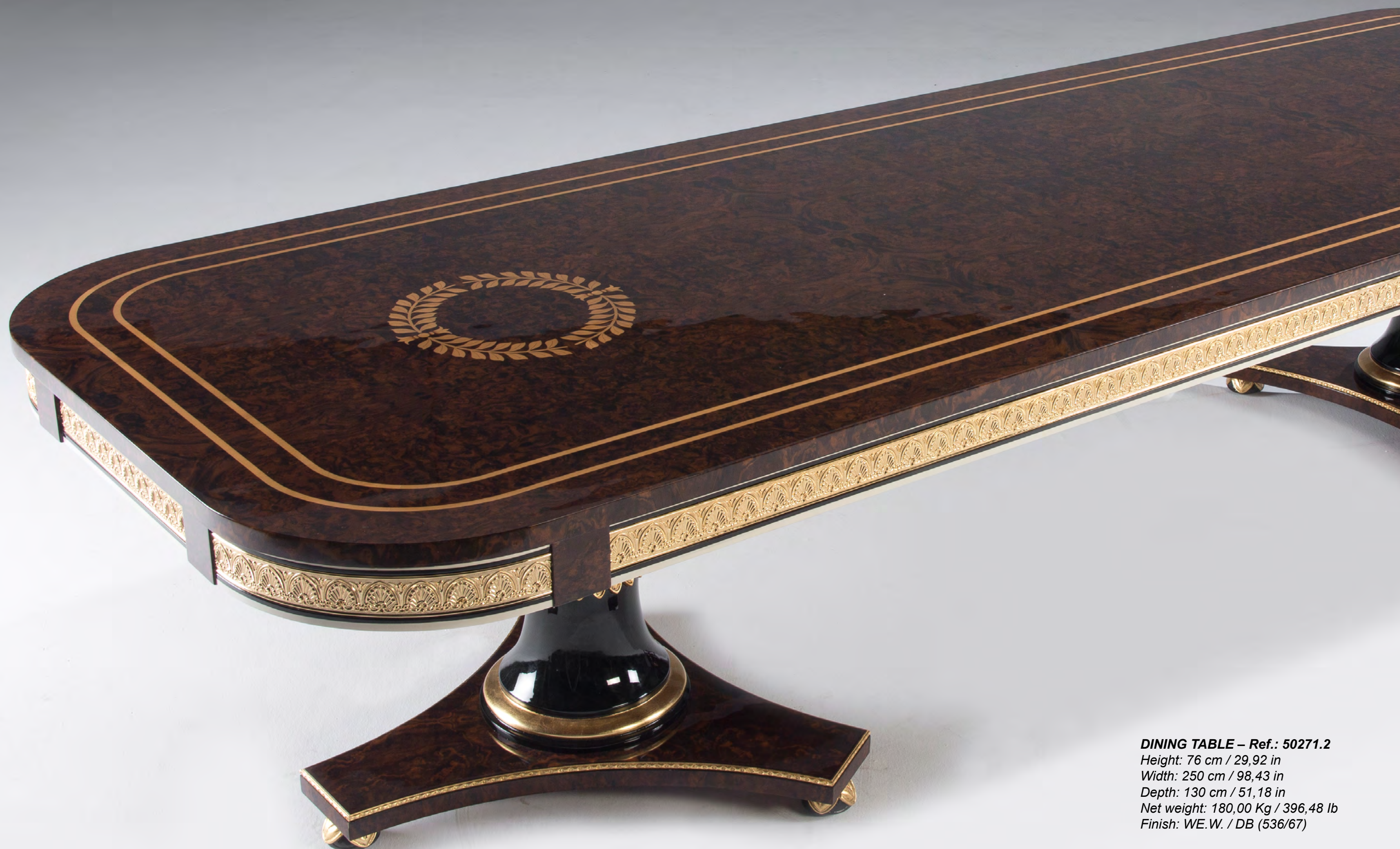
DINING TABLE – Ref.: 50271.2 Height: 76 cm / 29,92 in Width: 250 cm / 98,43 in Depth: 130 cm / 51,18 in Net weight: 180,00 Kg / 396,48 lb Finish: WE.W. / DB (536/67)