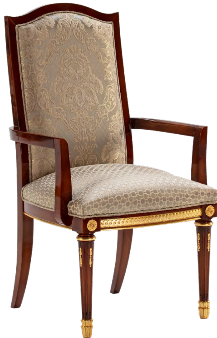
ARMCHAIR – Ref.: 50522.0 Height: 112 cm / 44,09 in Width: 60 cm / 23,62 in Depth: 68 cm / 26,77 in Net weight: 13,00Kg / 28,63 lb Finish: CAMD.B. POE/OA (524/231)