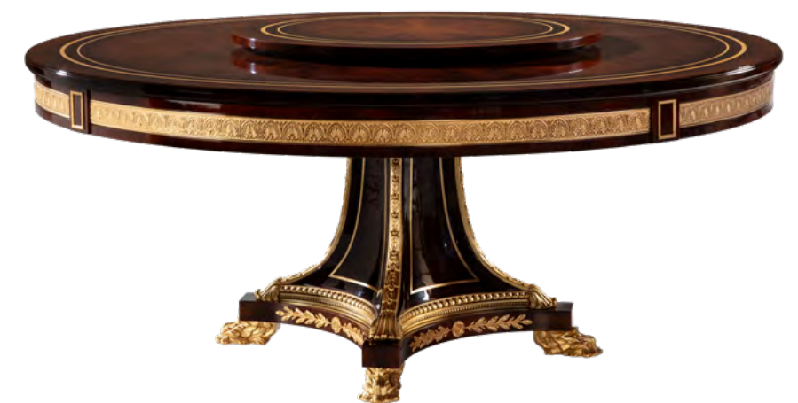
DINING TABLE – Ref.: 50516.0 Height: 81 cm / 31,89 in Width: 160Ø cm / 62,99 in Net weight: 120,00Kg / 264,32 lb Finish: CAMD.B. POE/OA (524/231)