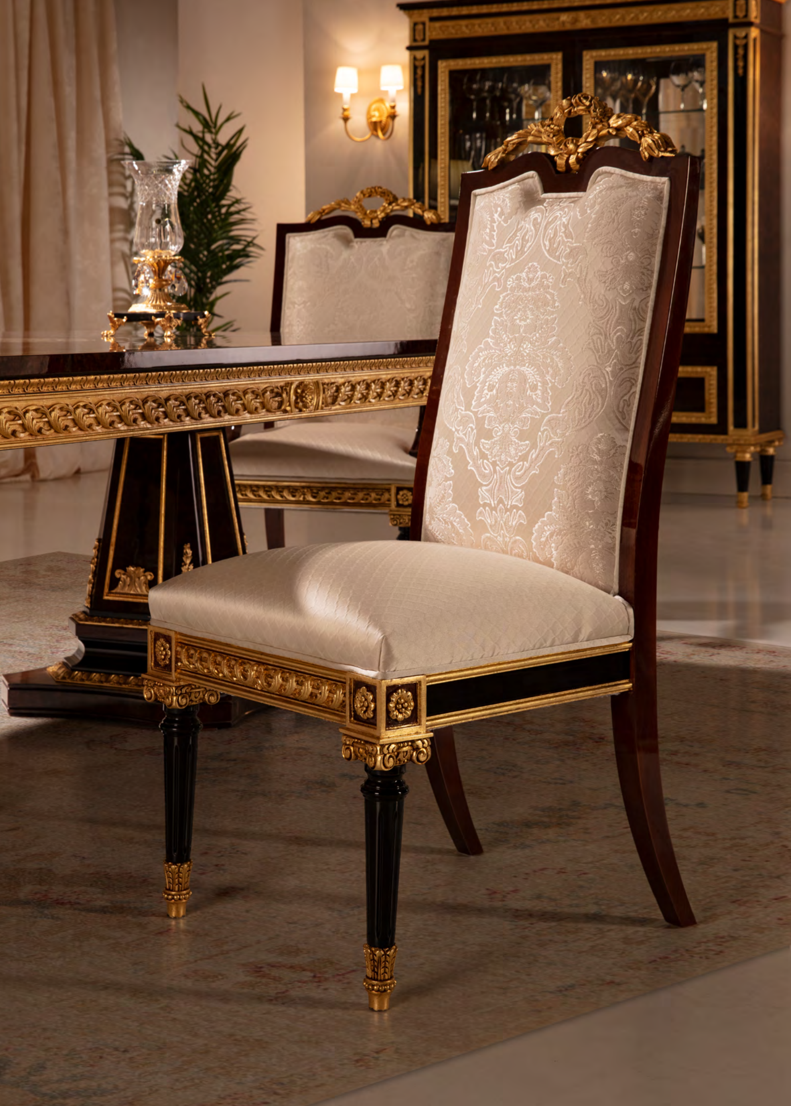
CHAIR – Ref.: 50599.0 Height: 119 cm / 46,85 in Width: 53 cm / 23,23 in Depth: 60 cm / 23,62 in Net weight: 9,00Kg / 19,84 lb Finish: NON.POE / OA (584/231)