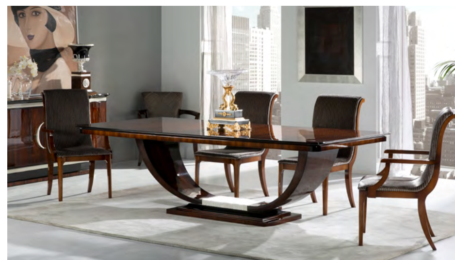
3. WILSHIRE COLLECTION ..... PAGE 190