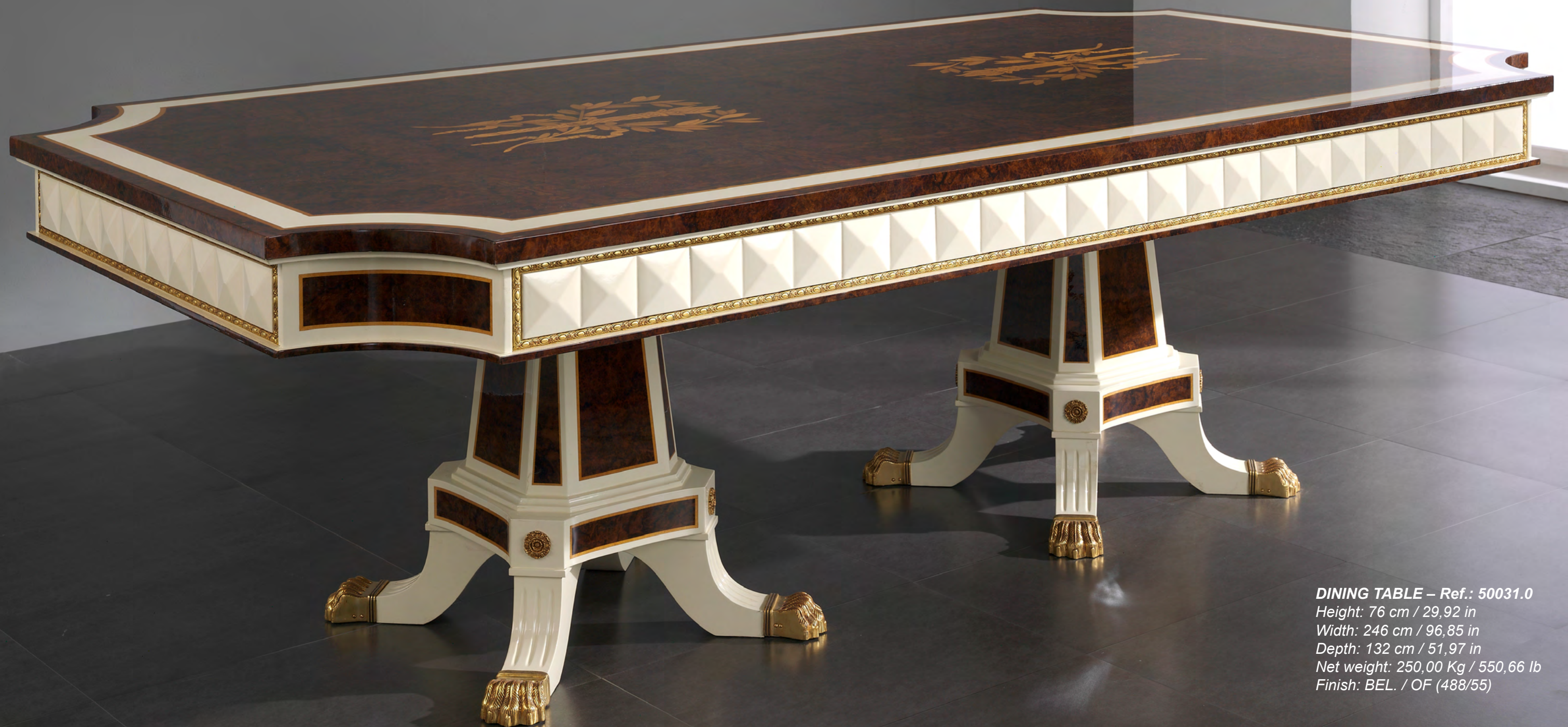
DINING TABLE – Ref.: 50031.0 Height: 76 cm / 29,92 in Width: 246 cm / 96,85 in Depth: 132 cm / 51,97 in Net weight: 250,00 Kg / 550,66 lb Finish: BEL. / OF (488/55)