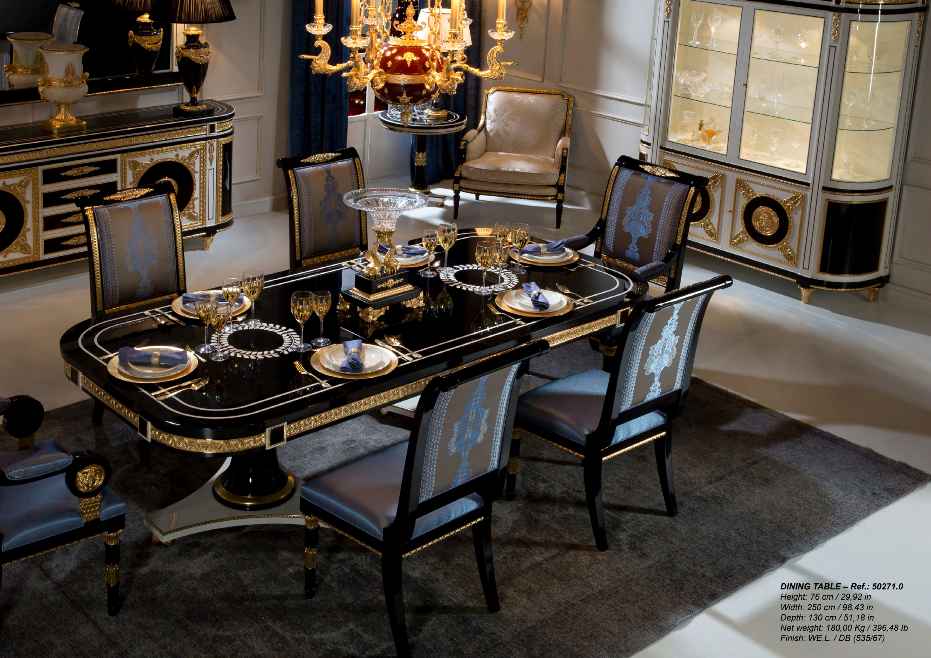
DINING TABLE – Ref.: 50271.0 Height: 76 cm / 29,92 in Width: 250 cm / 98,43 in Depth: 130 cm / 51,18 in Net weight: 180,00 Kg / 396,48 lb Finish: WE.L. / DB (535/67)