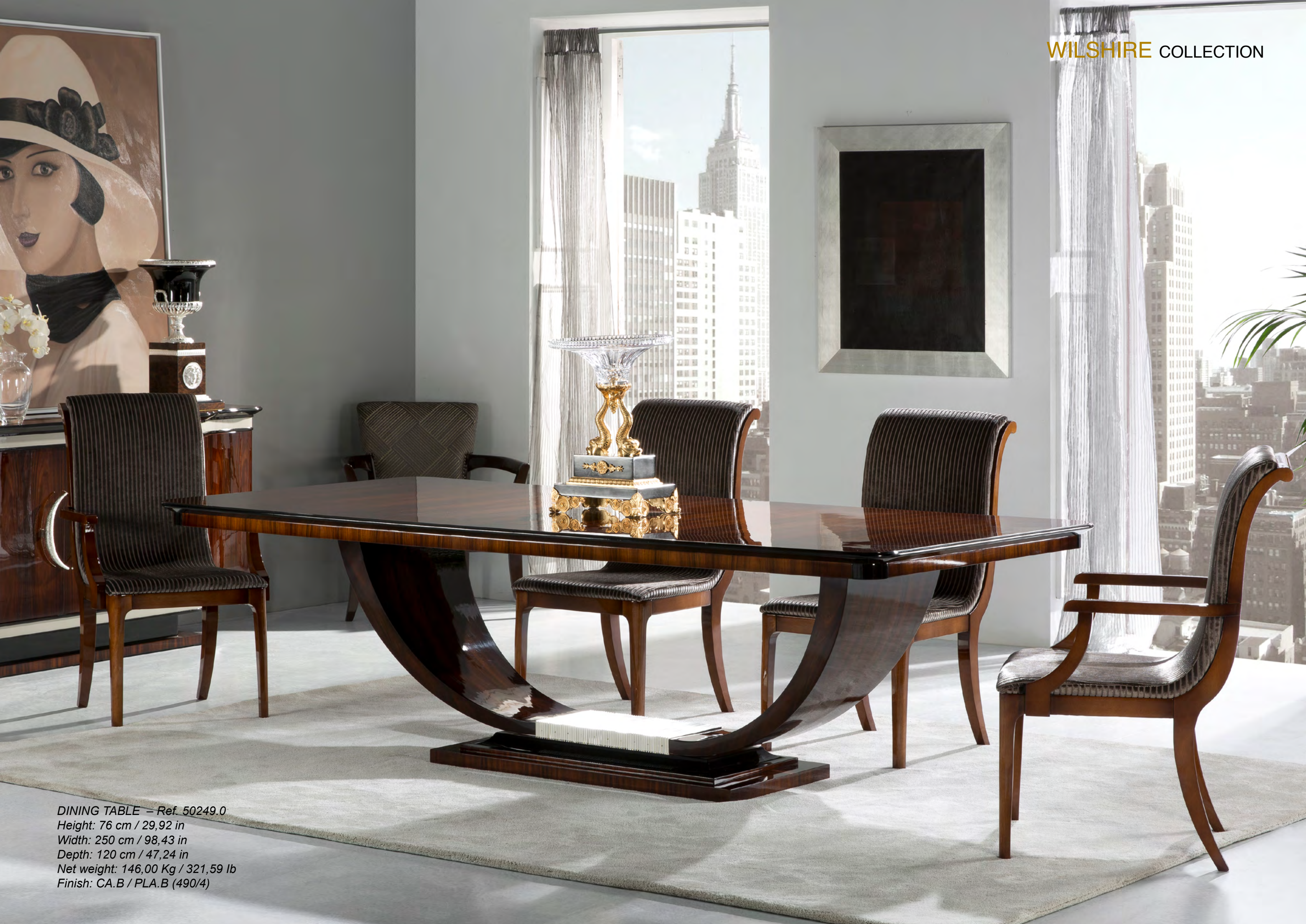
DINING TABLE – Ref. 50249.0 Height: 76 cm / 29,92 in Width: 250 cm / 98,43 in Depth: 120 cm / 47,24 in Net weight: 146,00 Kg / 321,59 lb Finish: CA.B / PLA.B (490/4)