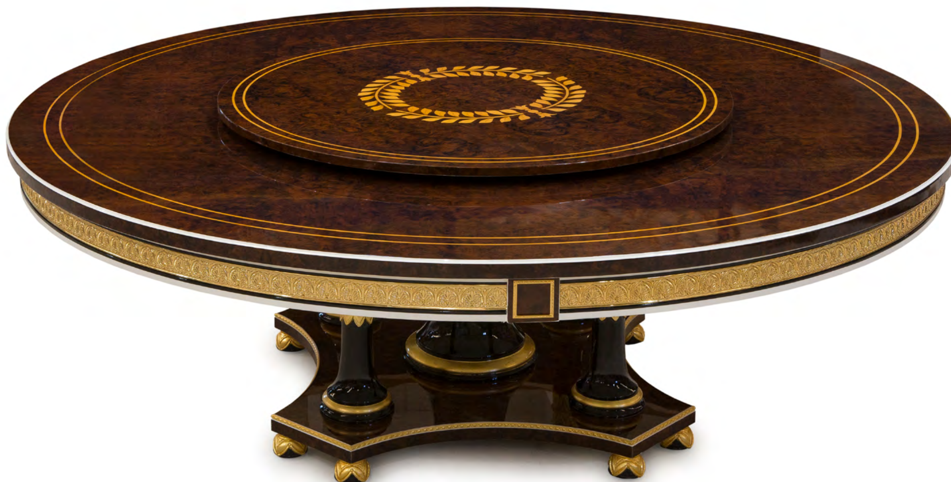
DINING TABLE – Ref.: 50496.2 Height: 81 cm / 31,89 in Width: Ø 220 cm / 86,61 in Net weight: 210,00 Kg / 462,56 lb Finish: WE.W. / DB (536/67)