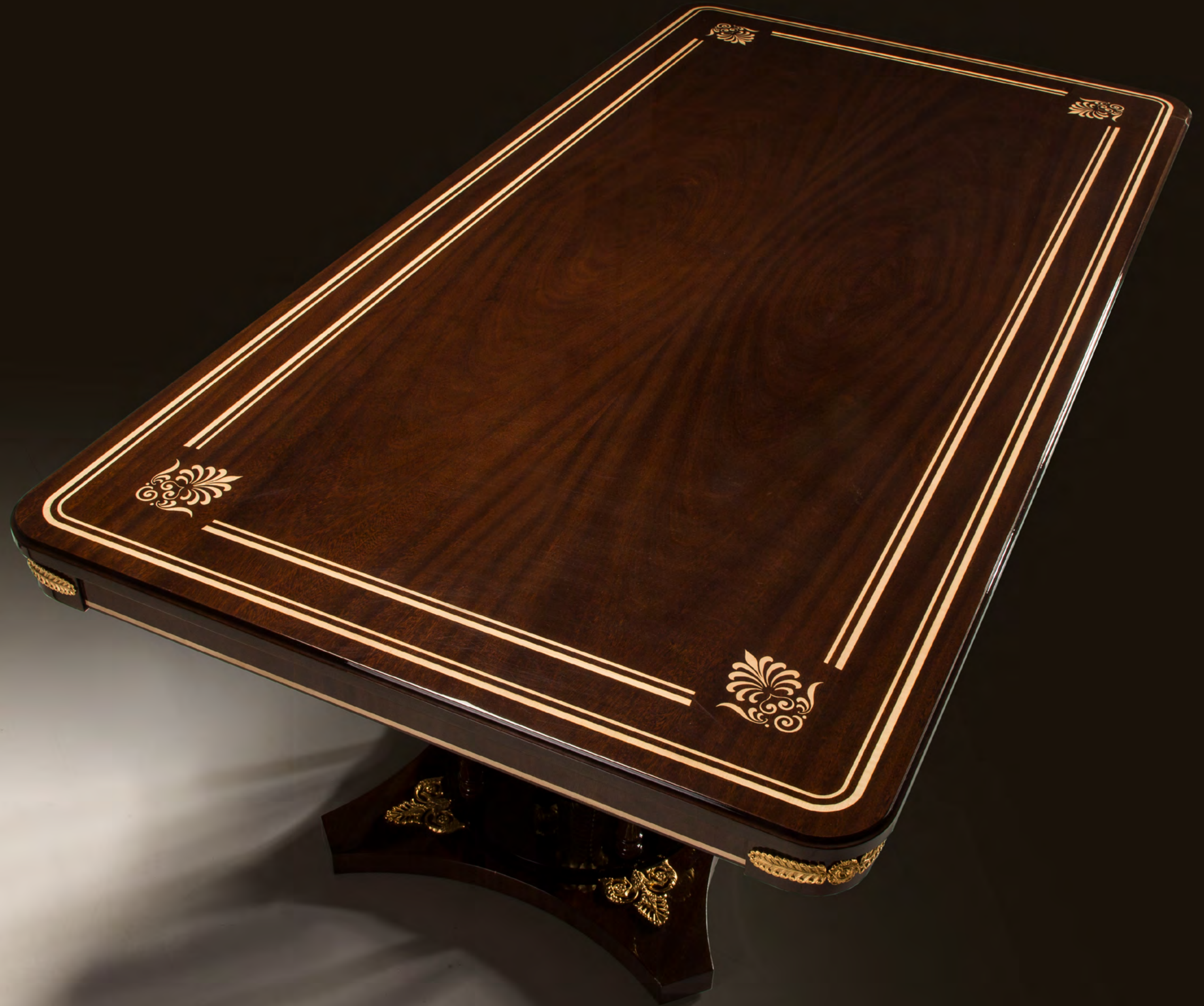
DINING TABLE – Ref.: 50477.0 Height: 78 cm / 30,71 in Width: 250 cm / 98,43 in Depth: 130 cm / 51,18 in Net weight: 208 ,00 Kg / 458,15 lb Finish: N.A.B / OA (515/231)