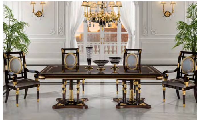
3. RIVOLI (page 42)