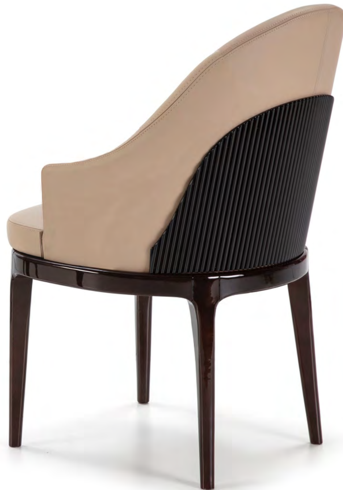
ARMCHAIR – Ref.: 50584.0 Height: 89 cm / 35,04 in Width: 56 cm / 22,05 in Depth: 58 cm / 22,83 in Net weight: 10,00 Kg / 22,03 lb Finish: MAK.B/NB (598)