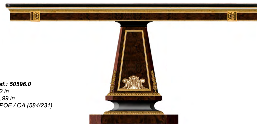
DINING TABLE – Ref.: 50596.0 Height: 77 cm / 30,32 in Width: Ø160 cm / 62,99 in Finish: Finish: NON.POE / OA (584/231)