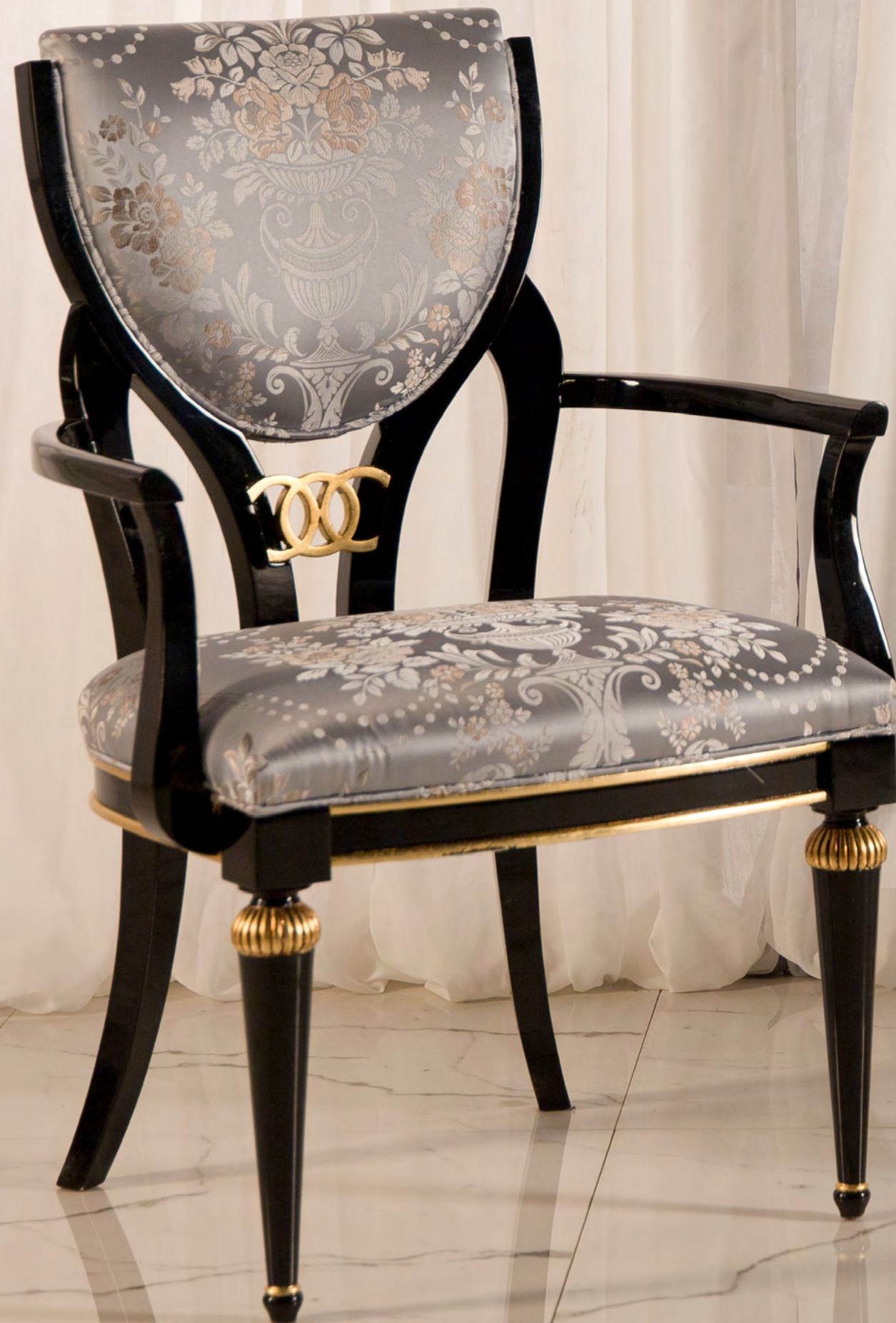
CHAIR – Ref.: 50344.0 Height: 97 cm / 38,19 in Width: 55 cm / 21,65 in Depth: 58 cm / 22,83 in Net weight: 7,00 Kg / 15,42 lb Finish: NAN. (544) Suggested Fabric: 241.185