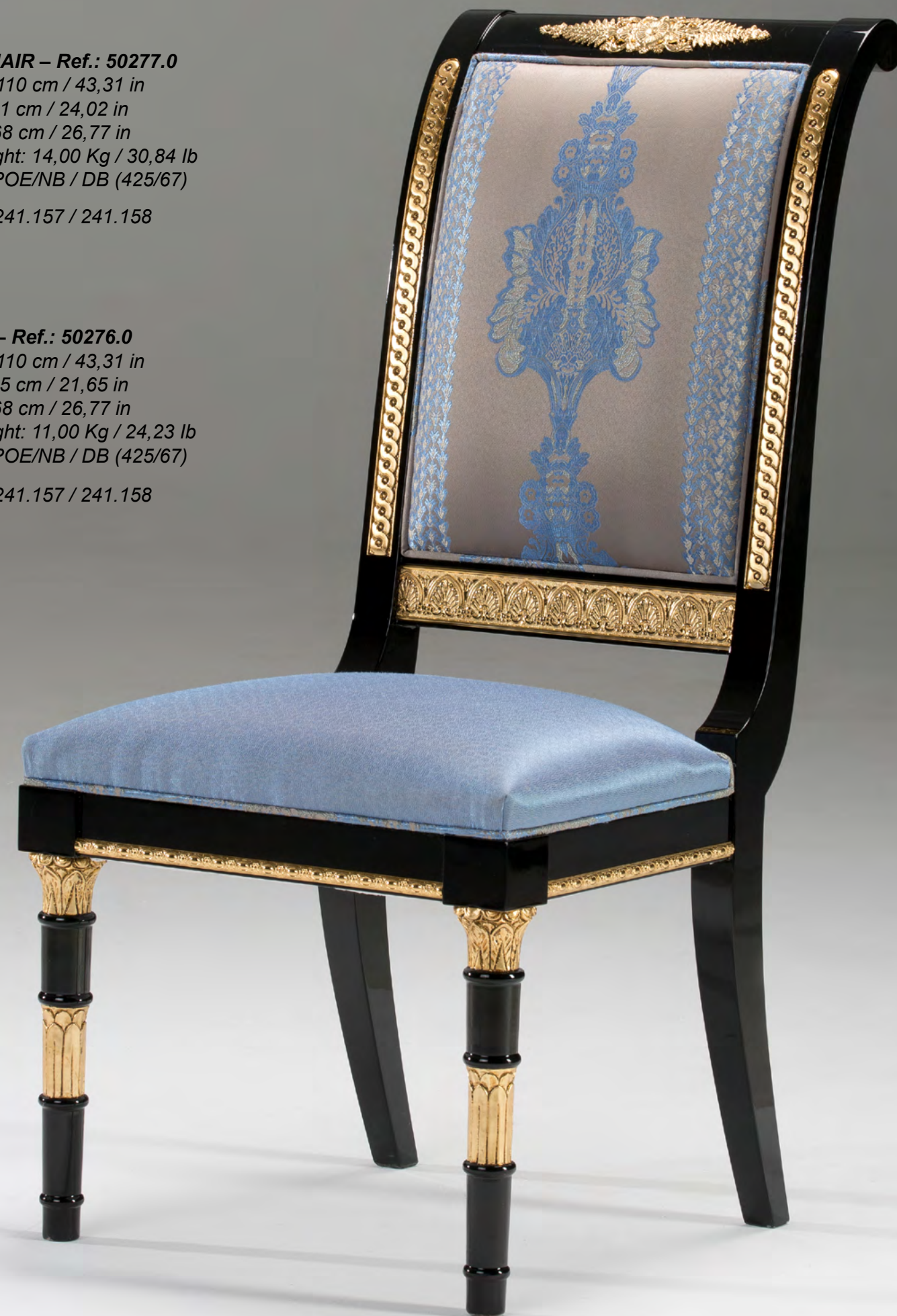
CHAIR – Ref.: 50276.0 Height: 110 cm / 43,31 in Width: 55 cm / 21,65 in Depth: 68 cm / 26,77 in Net weight: 11,00 Kg / 24,23 lb Finish: POE/NB / DB (425/67) Fabric: 241.157 / 241.158