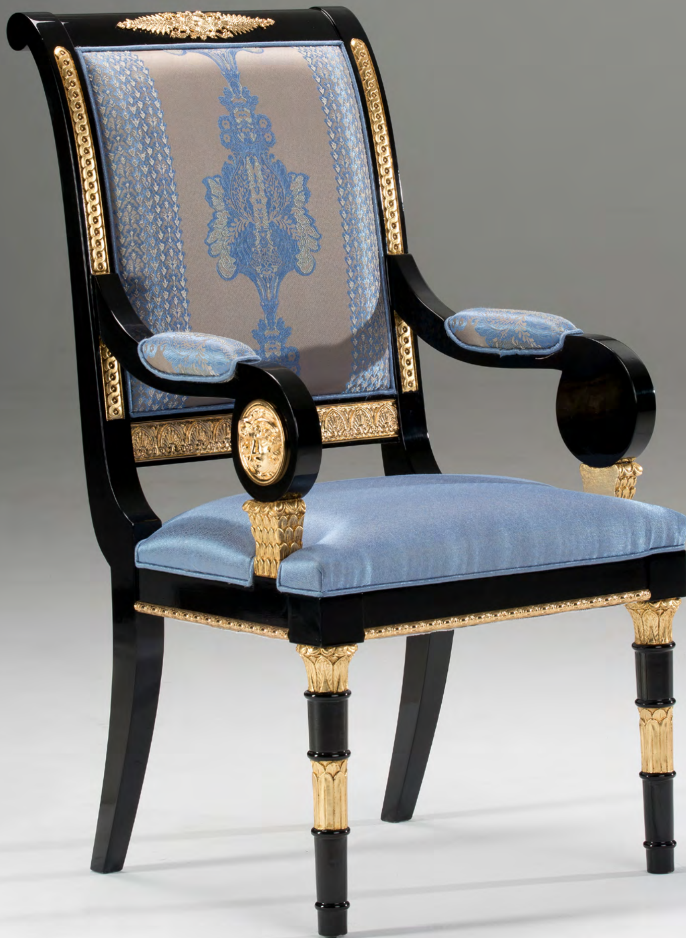
ARMCHAIR – Ref.: 50277.0 Height: 110 cm / 43,31 in Width: 61 cm / 24,02 in Depth: 68 cm / 26,77 in Net weight: 14,00 Kg / 30,84 lb Finish: POE/NB / DB (425/67) Fabric: 241.157 / 241.158