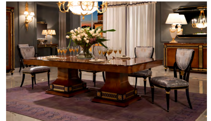
6. NANTES (page 114)