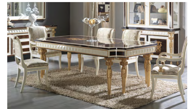
7. BELGRAVIA (page 132)