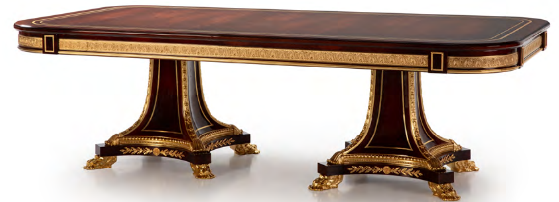
DINING TABLE – Ref.: 50515.0 Height: 76 cm / 29,92 in Width: 250 cm / 98,43 in Depth: 130 cm / 51,18 in Net weight: 180,00Kg / 396,48 lb Finish: CAMD.B. POE/OA (524/231)