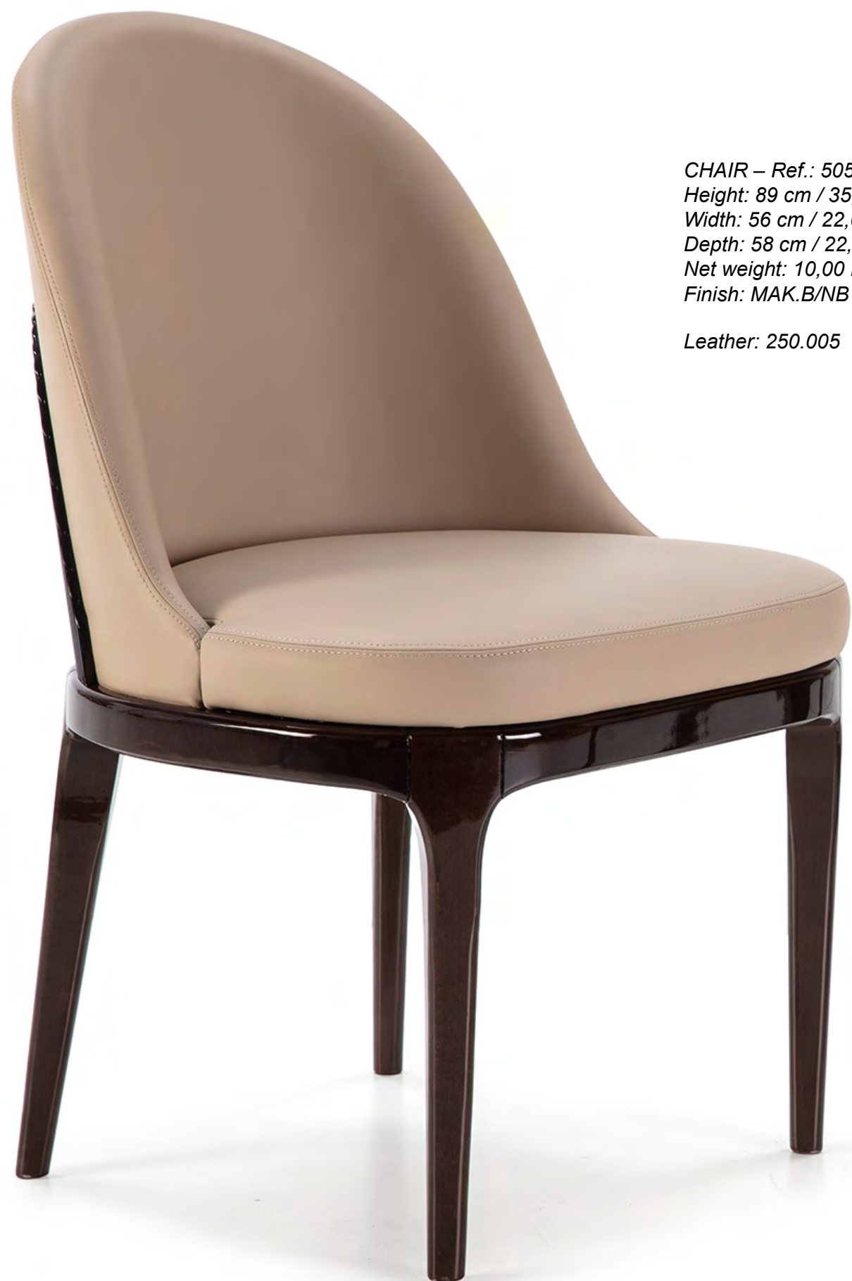
CHAIR – Ref.: 50527.0 Height: 89 cm / 35,04 in Width: 56 cm / 22,05 in Depth: 58 cm / 22,83 in Net weight: 10,00 Kg / 22,03 lb Finish: MAK.B/NB (598)