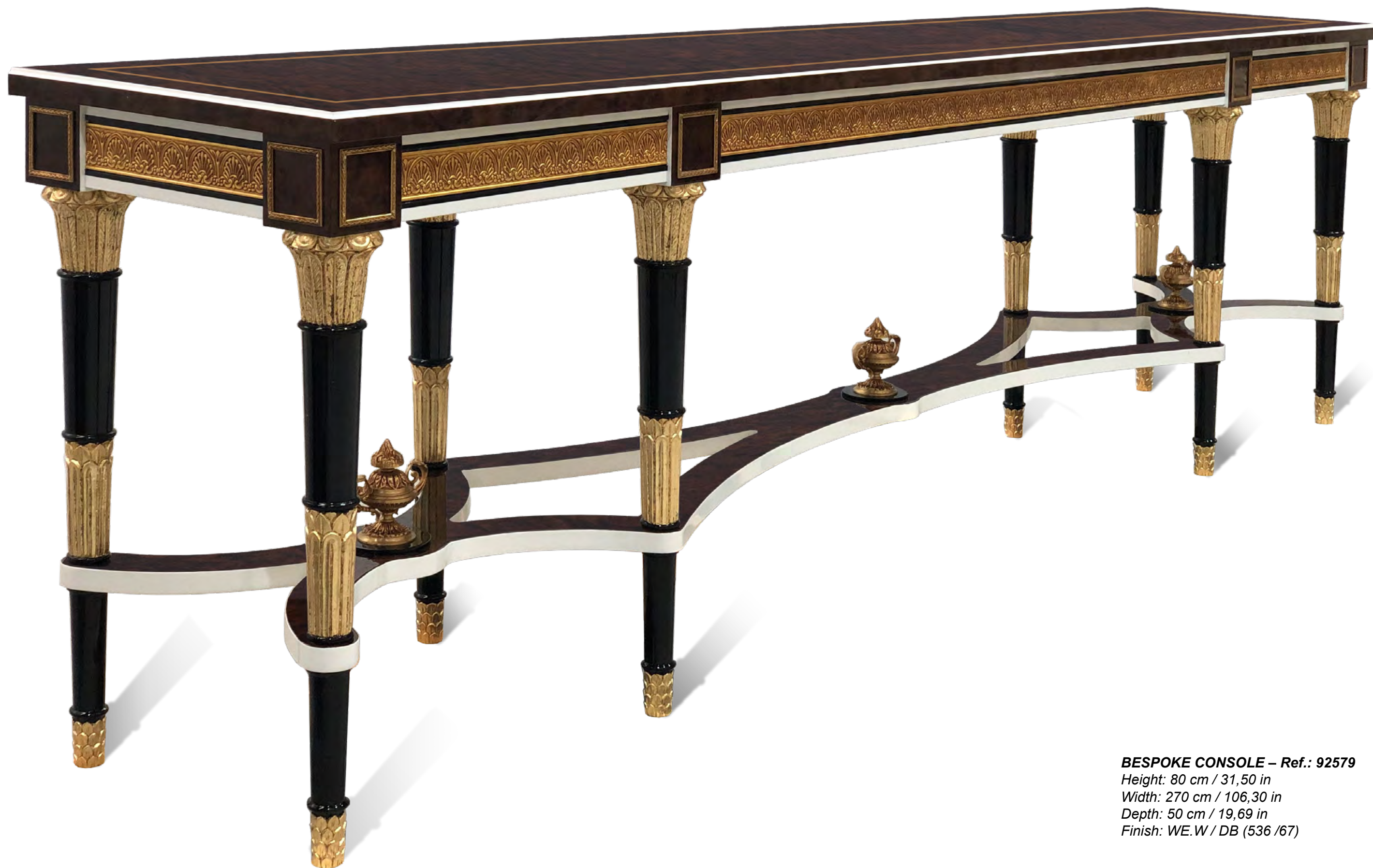
BESPOKE CONSOLE – Ref.: 92579