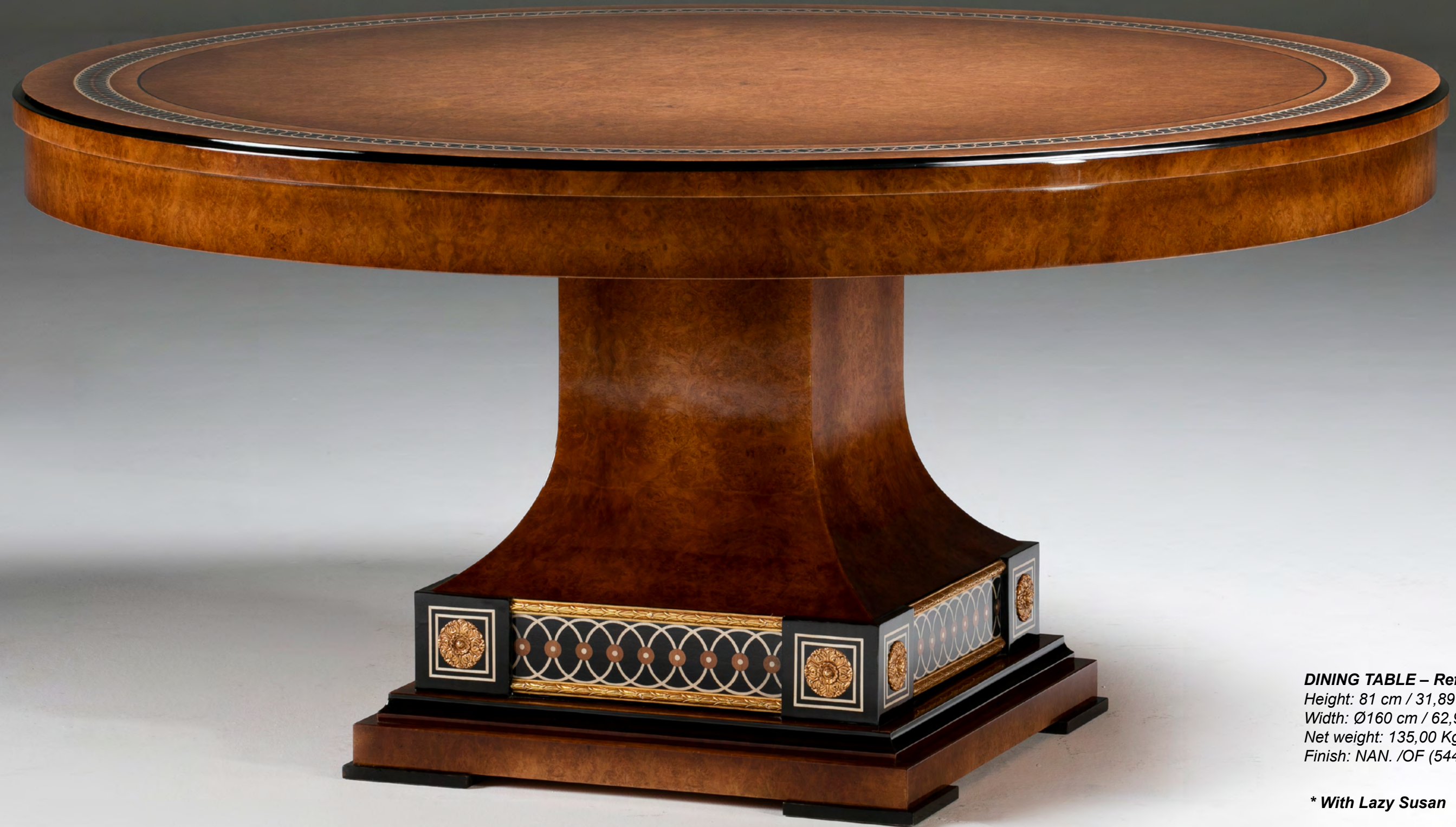
DINING TABLE – Ref.: 50340.0 Height: 81 cm / 31,89 in Width: Ø160 cm / 62,99 in Net weight: 135,00 Kg / 297,36 lb Finish: NAN. /OF (544/55)