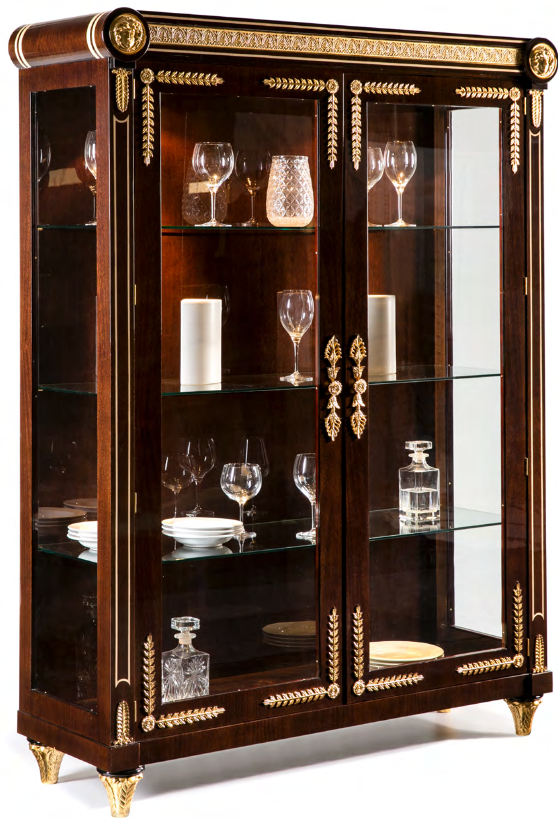
CABINET – Ref.: 50480.0 Height: 203 cm / 79,92 in Width: 150 cm / 59,06 in Depth: 52 cm / 20,47 in Net weight: 149,00 Kg / 328,19 lb Finish: N.A.B / OA (515/231)