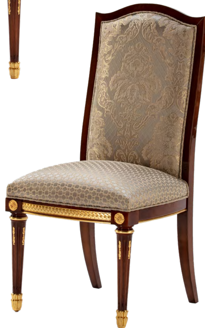
CHAIR – Ref.: 50521.0 Height: 112 cm / 44,09 in Width: 60 cm / 23,62 in Depth: 65 cm / 25,59 in Net weight: 11,00Kg / 24,23 lb Finish: CAMD.B. POE/OA (524/231)