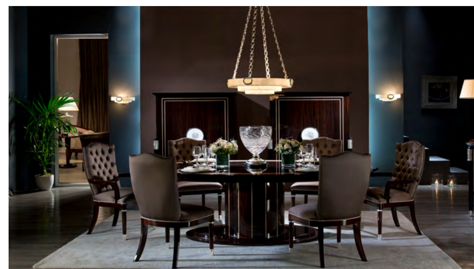
2. GATSBY COLLECTION ..... PAGE 172