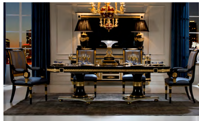
4. WELLINGTON (page 62)