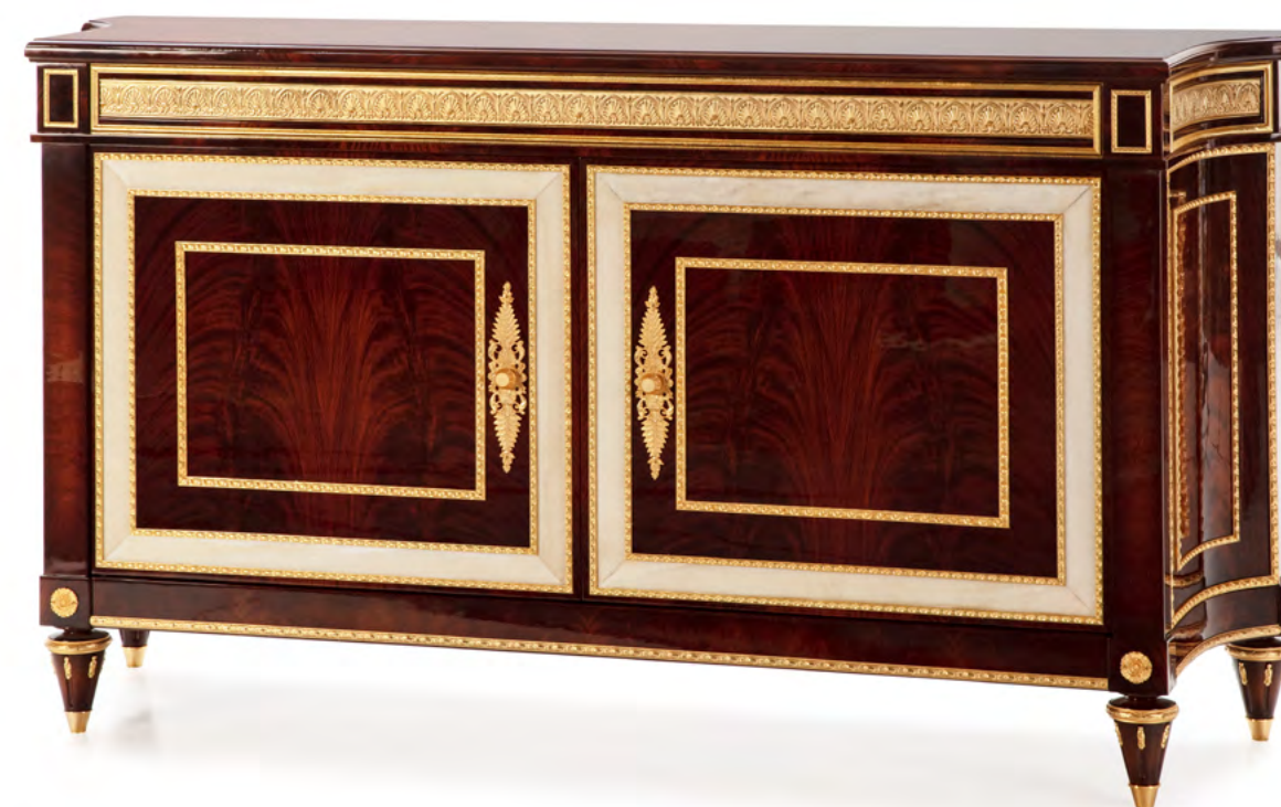
◀ CABINET – Ref.: 50520.0 Height: 220 cm / 86,61 in Width: 175 cm / 68,9 in Depth: 50 cm / 19,69 in Net weight: 220,00Kg / 484,58 lb Finish: CAMD.B.POE/ OA (524/231)