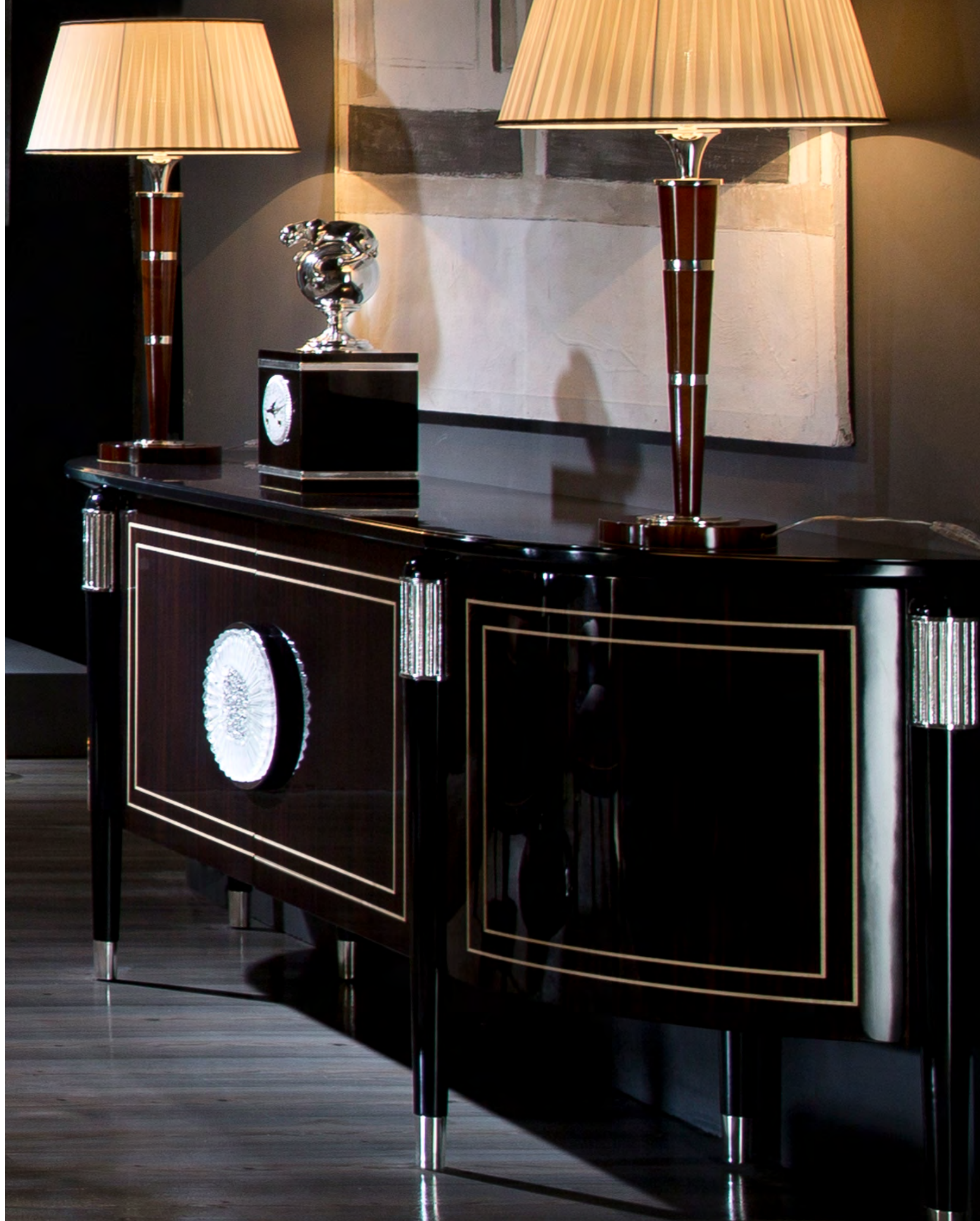
SIDEBOARD – Ref. 50221.0 Height: 95 cm / 37,4 in Width: 240 cm / 94,49 in Depth: 50 cm / 19,69 in Net weight: 140,00 Kg / 308,37 lb Finish: MAK.B / PLA.B / AC.B (486/531)