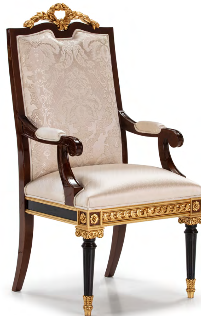
ARMCHAIR – Ref.: 50600.0 Height: 119 cm / 46,85 in Width: 59 cm / 23,23 in Depth: 60 cm / 23,62 in Net weight: 11,00Kg / 24,25 lb Finish: NON.POE / OA (584/231)