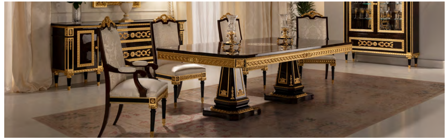
1. TRIANON (page 6)