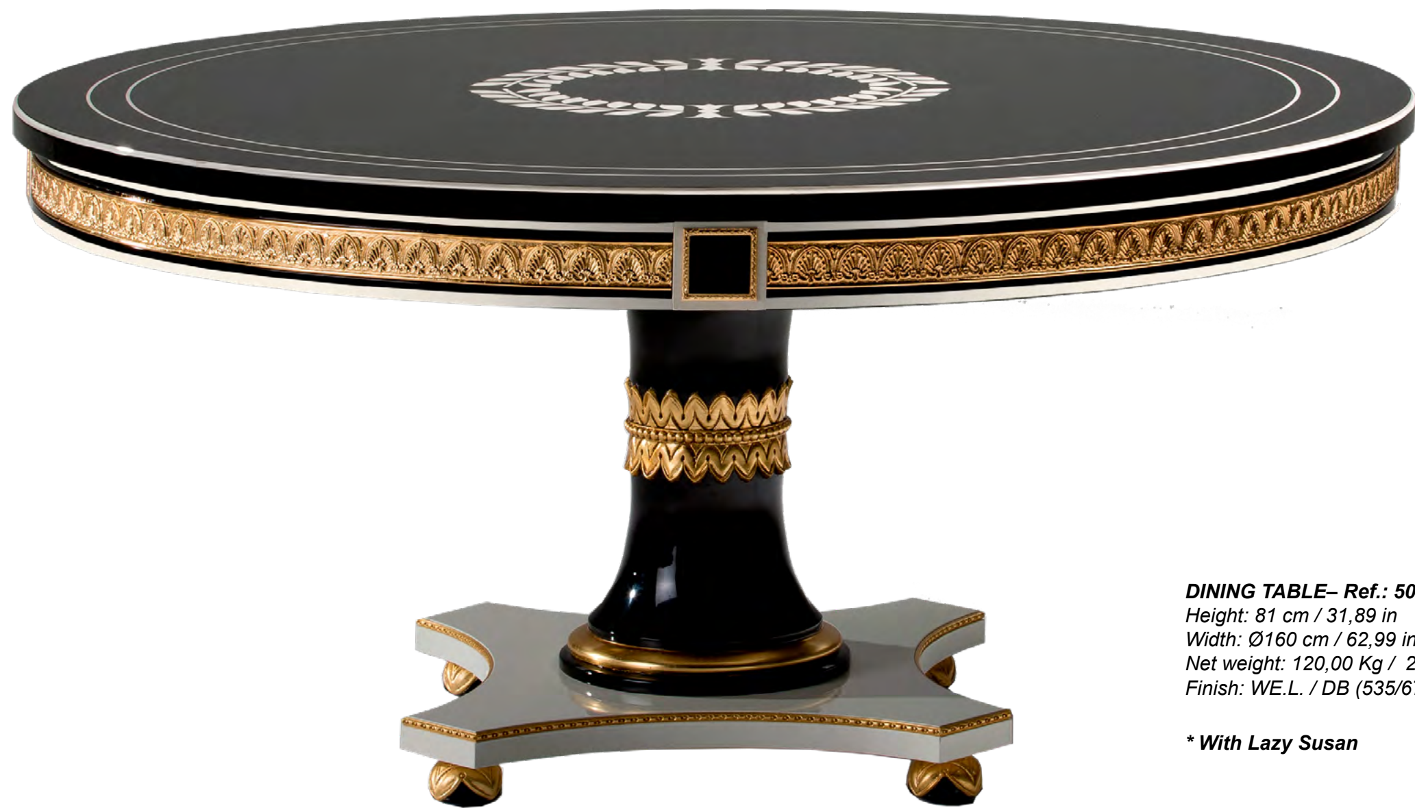
DINING TABLE– Ref.: 50272.0 Height: 81 cm / 31,89 in Width: Ø160 cm / 62,99 in Net weight: 120,00 Kg / 264,32 lb Finish: WE.L. / DB (535/67)