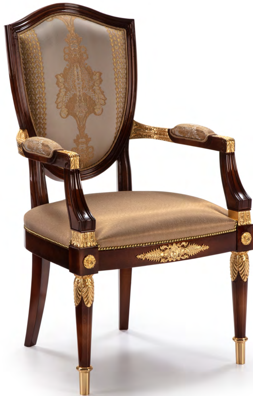
ARMCHAIR – Ref.: 50436.0 Height: 110 cm / 43,31 in Width: 57 cm / 22,44 in Depth: 67 cm / 26,38 in Net weight: 10,00 Kg /22,03 lb Finish: CAMD.B /OA (523/231) Fabric: 241.166 / 241.167