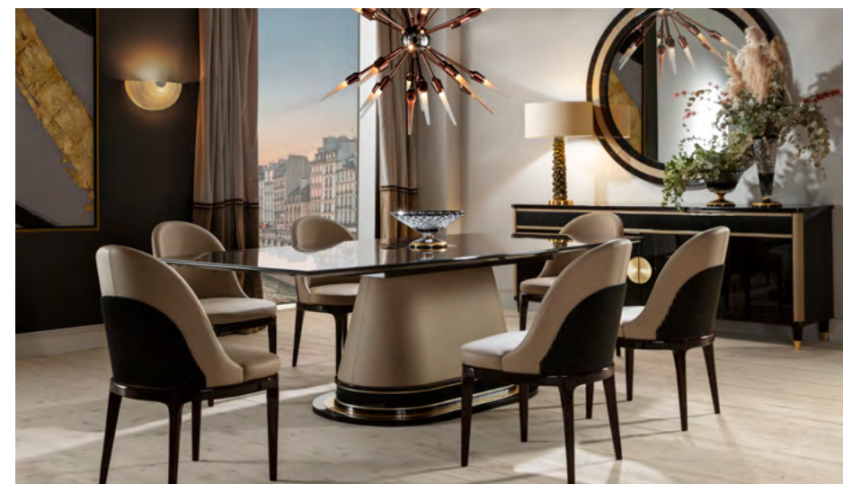
1. MONACO COLLECTION ..... PAGE 150