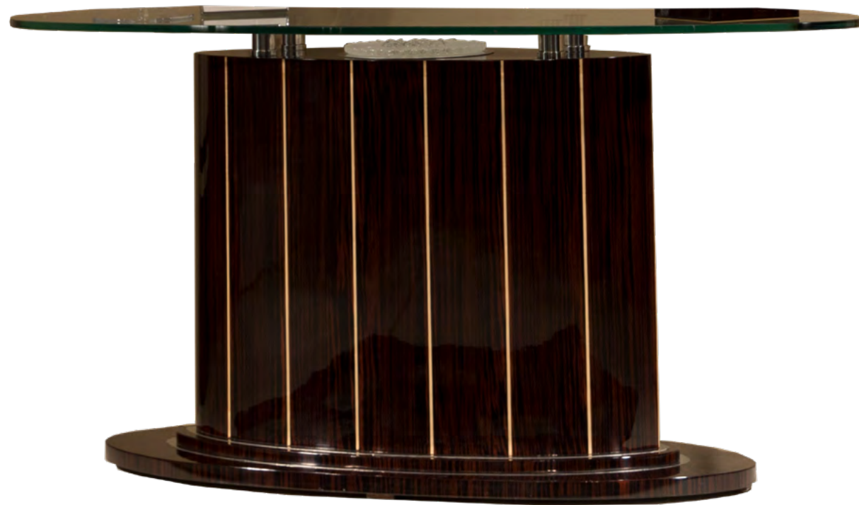
CONSOLE – Ref. 50268.0 Height: 81 cm / 31,89 in Width: 160 cm / 62,99 in Depth: 50 cm / 19,69 in Net weight: 60,00 Kg / 132,16 lb Finish: MAK.B / AC.B (486/477)