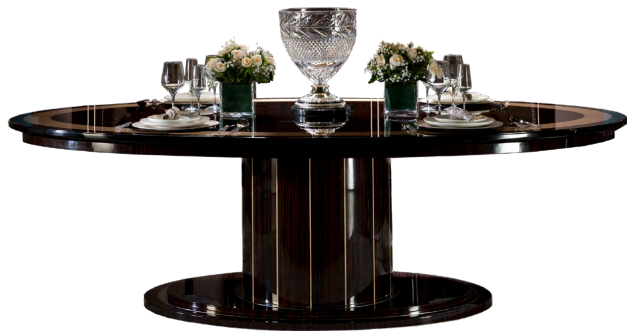
DINING TABLE – Ref. 50241.0 Height: 77 cm / 30,31 in Width: 250 cm / 98,43 in Depth: 150 cm / 59,06 in Net weight: 176,00 Kg / 387,67 lb Finish: MAK.B / AC.B (486/477)