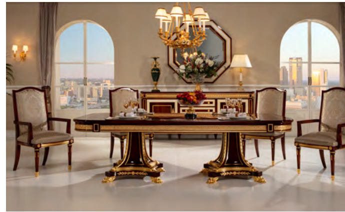
2. LANCASTER (page 24)