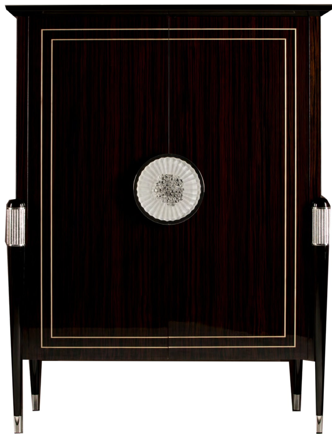
CABINET – Ref. 50242.0 Height: 172 cm / 67,72 in Width: 131 cm / 51,57 in Depth: 50 cm / 19,69 in Net weight: 135,00 Kg / 297,36 lb Finish: MAK.B / PL.B / AC.B (486/531)